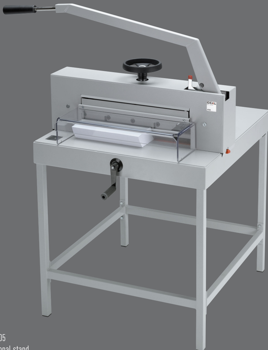
IDEAL 4705 with optional stand