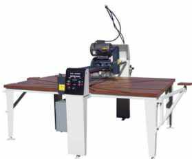
0710 Power Feed Miter Saw