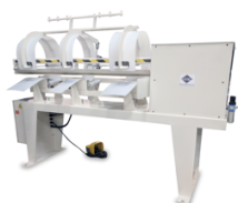
7100 Laminate Roller