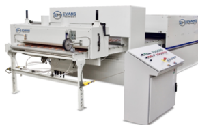
Countertop Laminating Systems