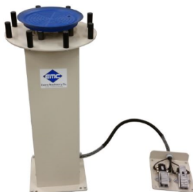
9100 Vacuum Stand