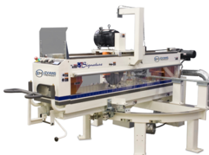
Countertop Miter Saws