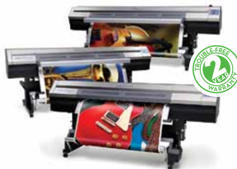
SOLJET PRO III XJ-740 74" INKJET PRINTER (shown with optional DU system)