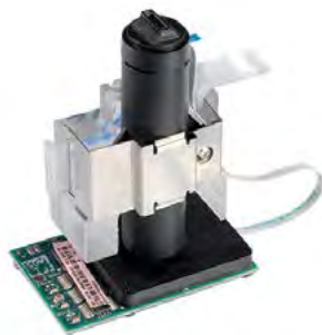
HP Optical Media Advance Sensor (OMAS)

The HP Optical Media Advance Sensor (OMAS) allows you to print at top speeds and still get great output results. This breakthrough technology improves paper-advance control and accuracy, so the printer can print at higher speeds across multiple environmental conditions without impairing image quality.