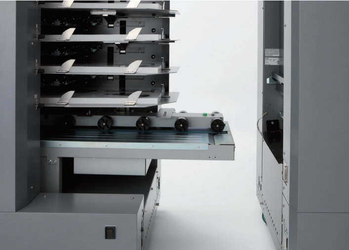
Optional bridge unit