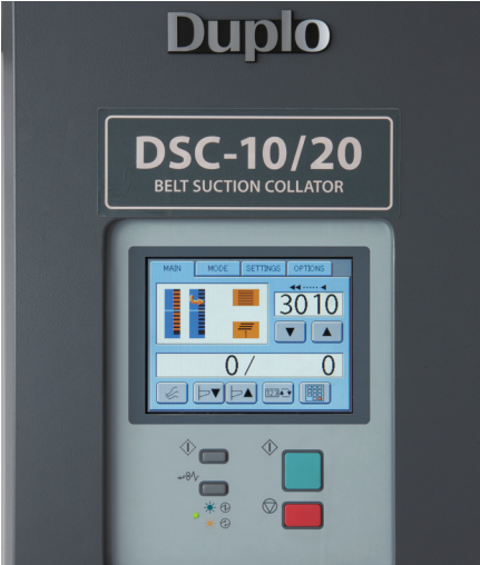
Colour touch screen

Changing between booklet sizes takes just seconds. Simply select the required size, and the side guides adjust automatically. For smaller books, the staple positions can be brought closer together if required.