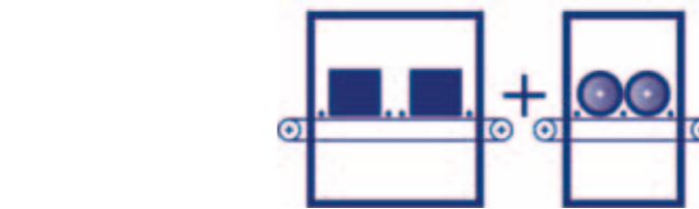
UniSander 2.4.0.K + 1.2.0.K Cross and longitudinally sanding. 100% profile sanding.