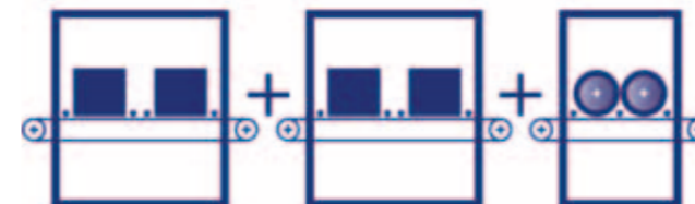
UniSander 2.4.0.K + 2.4.0.K + 1.2.0.K Cross and longitudinally sanding. 100% profile sanding. High line speed.