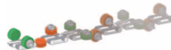
ProfileSander Profile sander which can be mounted with up to 12 sanding stations.