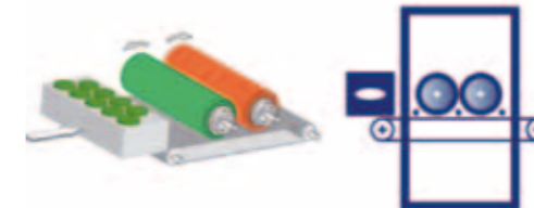
Aut. EdgeSander Automatically edge sanding on all longitudinally.