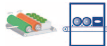
UniSander Disk Aggressive surfase sanding. Finish sanding – high gloss lacquer and folia / High Gloss. All types of materials.