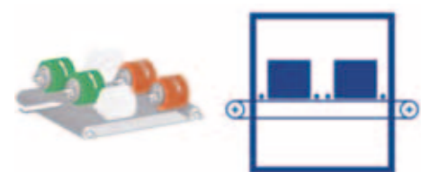
UniSander 2.4.0.K Cross sanding – profile on across.