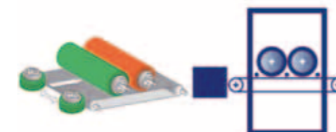
Diskaggregate Very aggressive surfce sanding-remove the lacquer sauges on edge in UV line. Finish sanding to high gloss lacquer.