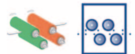
UniSander 2.2.2. Surfaces sanding – top and bottom.