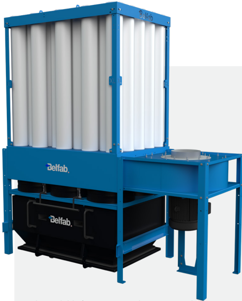
Only available for BEL 150 and BEL 200 models.

Our quiet Hummer blower, available from 10 to 20 HP. Our units are built with 14-gauge steel for durability and quiet operation. High-efficiency bean bag filters capture 99.99% of particles at 3.8 microns.