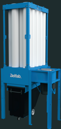
BEL 50XL or BEL 75XL

Discover the BEL Series by Belfab, the ultimate choice for dust collection. Ranging from 5 HP to 20 HP, it offers high efficiency and a full range of features. Designed in compliance with NFPA. Optimized for maximum performance, it includes dust disposal options that are engineered to minimize downtime. Ideal for wood dust, the BEL Series limits airborne particles, ensuring safety and a clean workspace. Trust Belfab for superior dust collection and a healthier work environment!