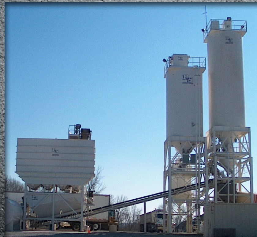
APACHE BATCH PLANT 943 ARROWHEAD SILO & 720 AUXILIARY SILO