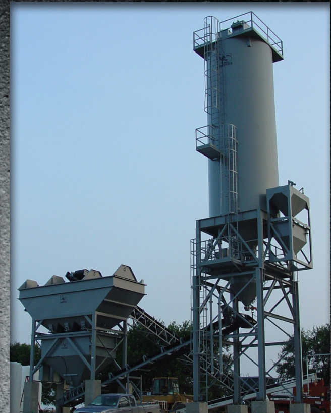
115 COMANCHE BATCH PLANT 720 ARROWHEAD SILO

Our goal is to build the best American product, with the best people, for the best customers all around the world. We seek to promote human relationships through business relationships, with people from different cultures, with different Faiths, from all different parts of the world, as well as with the people in our very midst. Our very top priority is to daily, demonstrate the character of Christ in our business and personal lives, without being dogmatic or offensive.