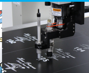
ADA Braille Sign