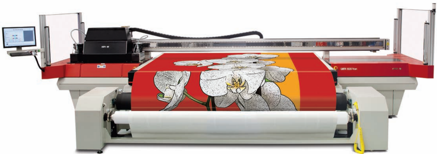
:Jeti 3020 Titan in its FTR configuration.

The Flat to Roll option gives you the ability to print roll materials with the same high quality and resolution as rigid materials, without losing speed, enabling you to print banners. The FTR option can handle rolls up to 250 lbs (113 kg) so you can buy media economically and compete in more markets.