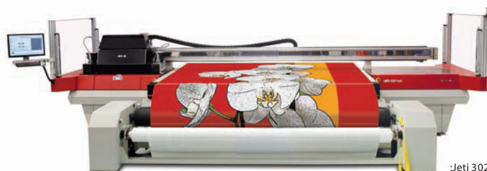
:Jeti 3020 Titan FTR