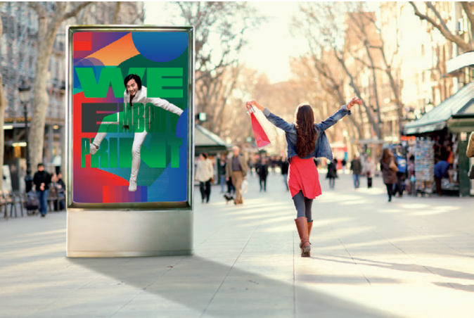
Outstanding print quality on backlit applications

The wide-format hybrid Anapurna i LED-series is a perfect fit for sign shops, digital printers, photo labs and mid-size graphic screen printers that want to combine board and roll-to-roll print jobs. The engines print at a width up to 3.2 m and combine excellent quality with high productivity for outdoor and indoor jobs. The hybrid Anapurna's are equipped with UV LED lamps, enabling you to print on a wider media mix and to save energy, costs and time. The white ink function creates possibilities for printing on transparent material for backlit applications or for printing white as a spot color. With the optional automatic board feeder, productivity is increased even more.