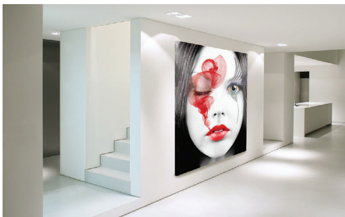
In-house decoration – dibond

Printing on backlit media? Creating an opaque white background? Using white as a spot color? The hybrid Anapurna LEDs supports white printing in multiple modes (e.g. pre-white, post-white, sandwich white) on both rigid and roll media. The stirring functionality keeps the white ink in motion at all times. Constant recirculation flows along the ink lines—all the way to the temperature-controlled printer heads—limiting the risk of ink resettling and lines becoming blocked or clogged.