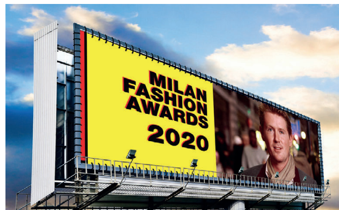
Outdoor communication – vinyl