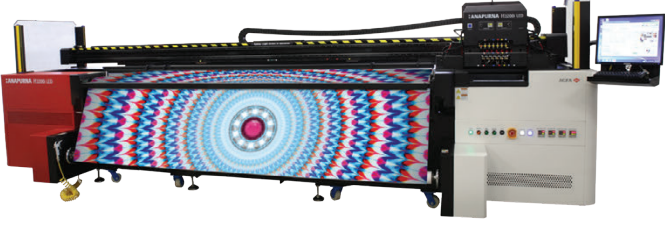
Anapurna H3200i LED