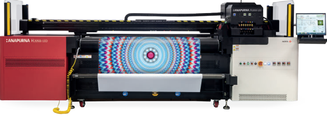
Anapurna H2050i LED