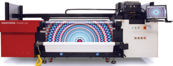
Anapurna H1650i LED