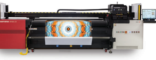
Anapurna H2500i LED