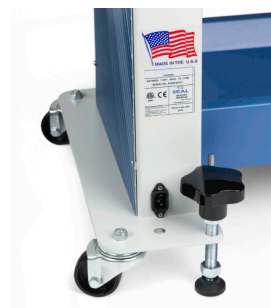
Optional Heavy duty rear stabilizing feet.