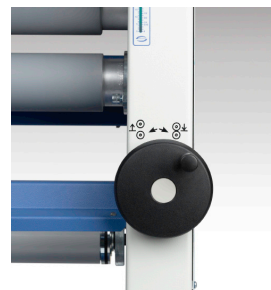
Manual nip adjustment with height gauge for precise operation.