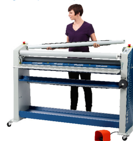
Light-weight auto grip shafts for user friendly webbing.