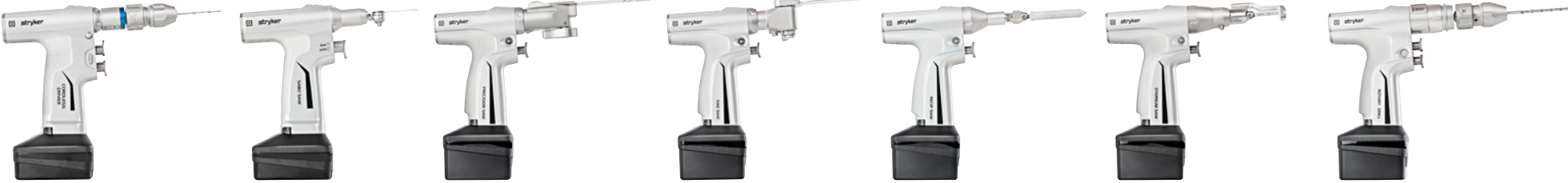
Cordless driver SABO Saw Stryker Precision Saw Sagittal saw Reciprocating saw Sternum saw Rotary drill