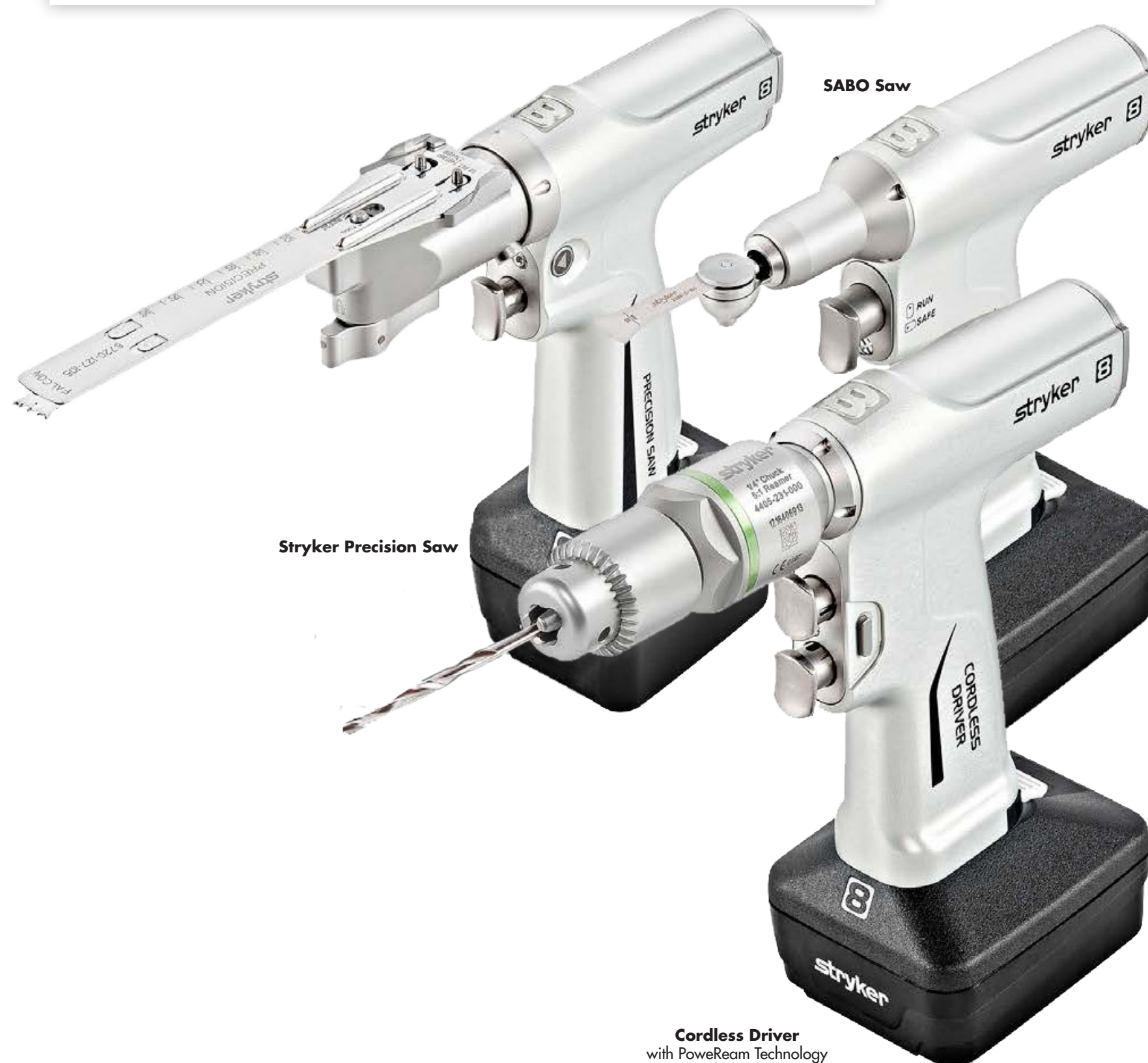
Cordless Driver with PowerReam Technology