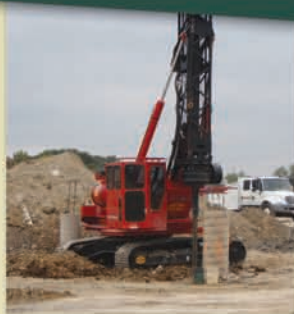
2500CM Short Mast