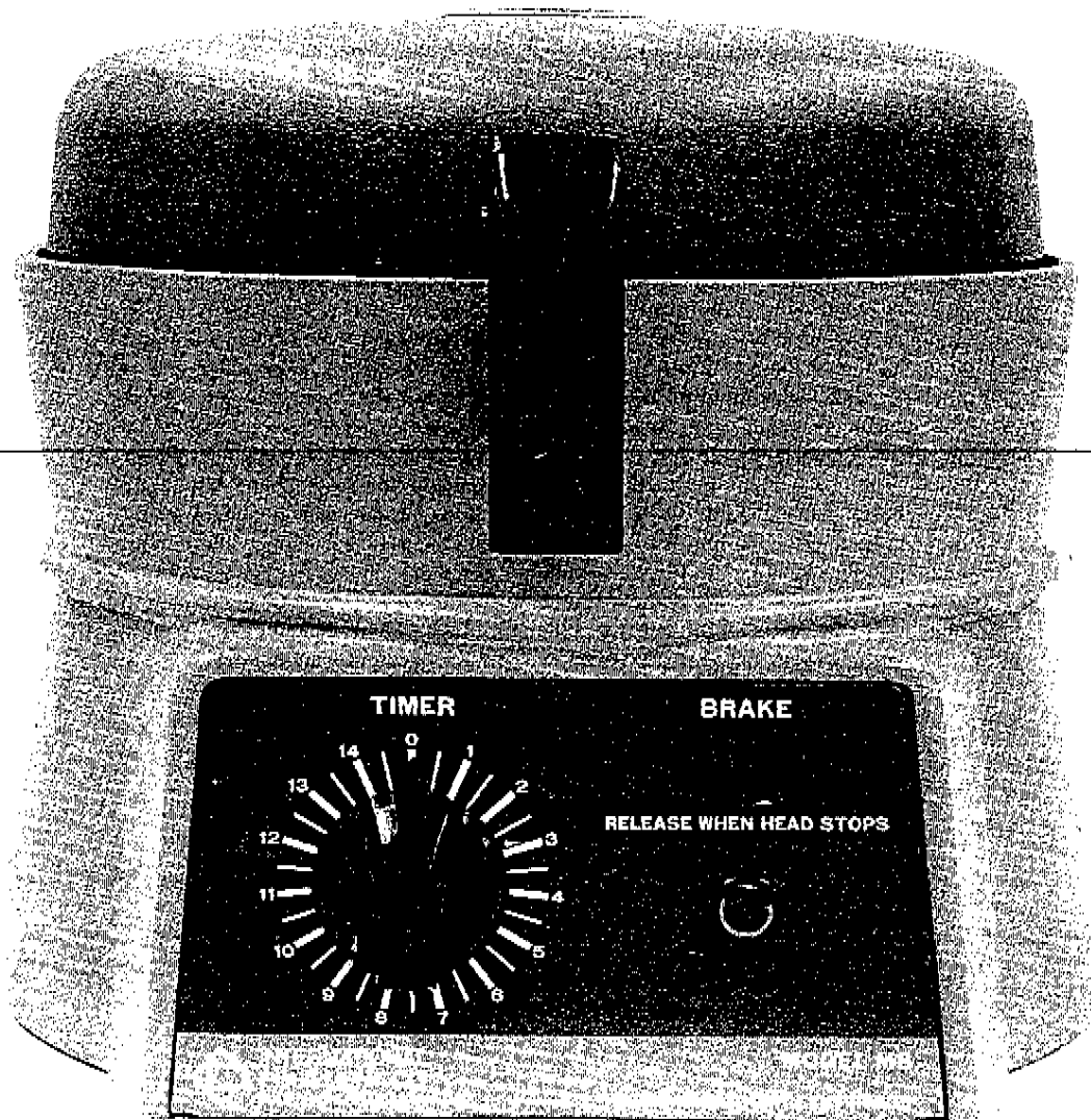
THE INTERNATIONAL MODEL MB CENTRIFUGE