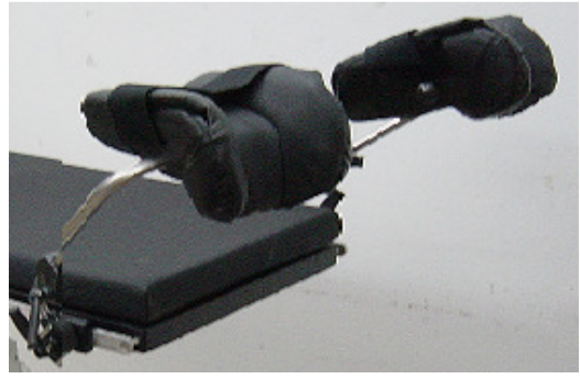
Patient Knee Crutches, included with system