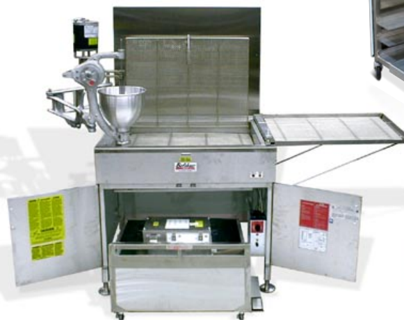
700 Series Gas Fryer Type F Donut Depositor EZ Melt Melter-Filter

The guide over the page will help to select the components that make up a donut system. Specifications for fryers and auxiliary equipment are available throughout the catalogue.