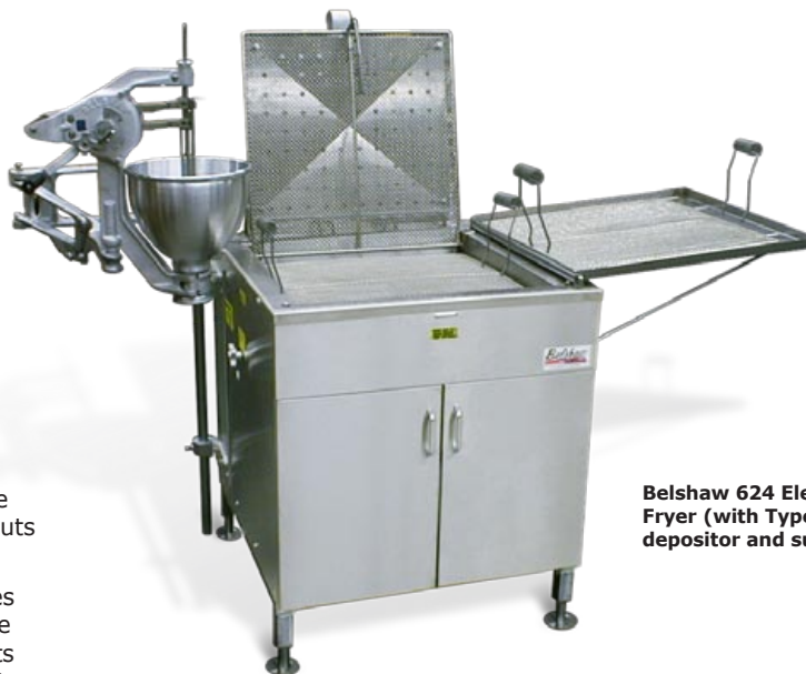
Belshaw 624 Electric Fryer (with Type 'B' donut depositor and submerger)