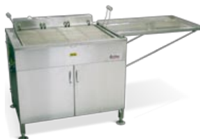
634 electric fryer (34" x 24")