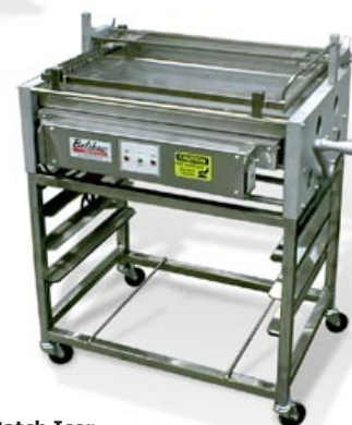
HI Batch Icer