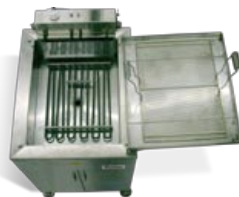
618L electric fryer (18" x 26")