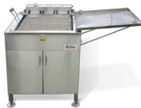
624 electric fryer (24" x 24")