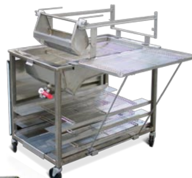
HGEZ EasyLift Glazer