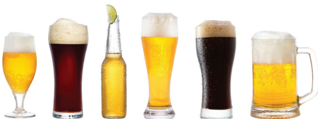
A range of ales, lagers and bitters treated with Carlson filters

To fulfil the total filtration requirements of a small to large brewery Carlson can advise on and provide all the ancillary filtration needs. These would incorporate process water for bottle / kege washing and tank cleaning, brewing liquor (water softening and de-aeration), steam filtration and CO 2 filtration for sparging and blanketing.