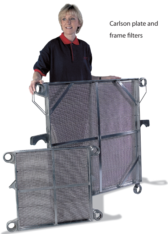
Carlson plate and frame filters

The beer will typically be held in a bright beer tank after this stage prior to the specific route to packaging.