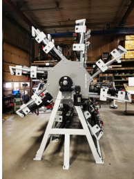
ROTARY CLAMP : 8 SECTIONS