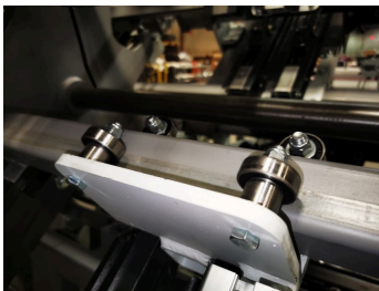
MOVABLE CLAMPS ON BEARINGS