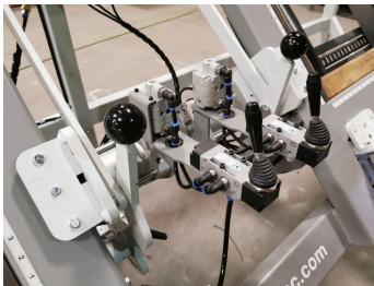
TRIPLE P SYSTEM