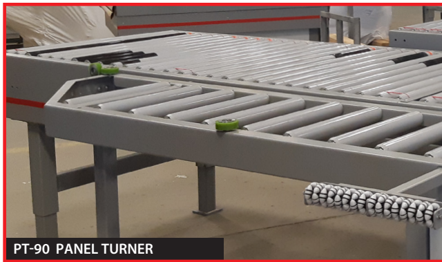
PT-90 PANEL TURNER