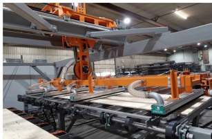
MANYX STACKER/DESTACKER VIEW 2