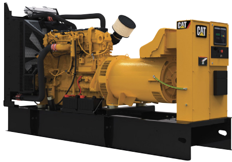
Image shown may not reflect actual package.