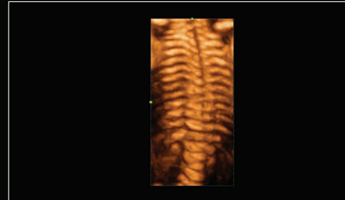
3D Fetal Spine