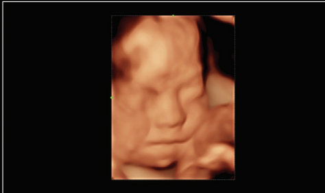
3D Surface Fetal Face

At Mindray, your mission is our foundation. You strive to provide patients with the best care possible and rely on outstanding medical devices to provide exceptional care with confidence. We were founded on the dream of increasing access to quality healthcare by providing accessible, relevant medical devices that exceed clinicians' expectations and needs. Our ultrasound solutions provide crystal clear ploppable imaging, color sensitivity with little flash artifact, and easy-to-use advanced technology to ensure clinicians have the information needed to provide confident answers and diagnoses.