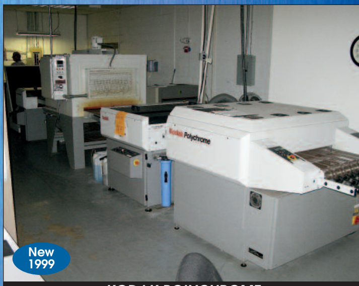
KODAK POLYCHROME COMPUTER TO PLATE SYSTEM