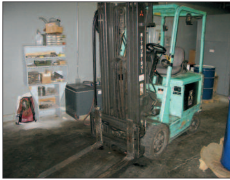
Mitsubishi 5000 lb. Electric Forklift