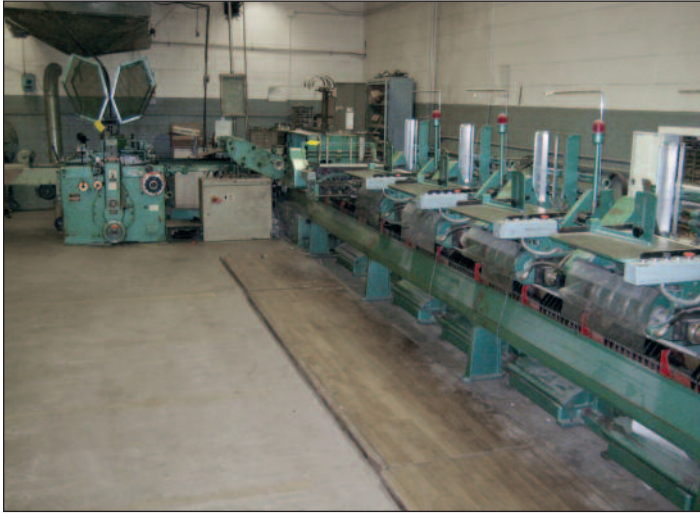
Consolidated-Osako Super Jet Stream 230 Saddle Stitcher