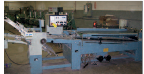
MBO Continuous Feed Folder Model B26-C