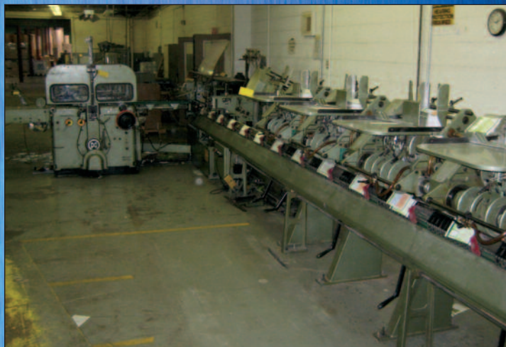
MULLER MARTINI FOX 221-4 SADDLE STITCHER