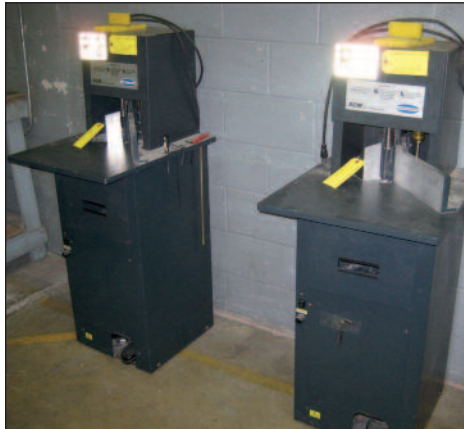
(2) Challenge CMC-431A Single Cornering Machine