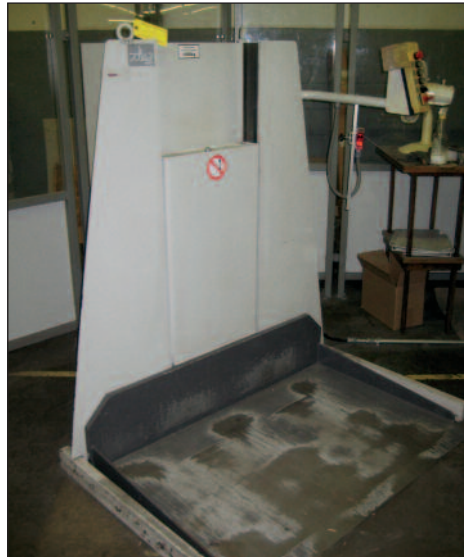
Polar Mohr LW1000-4 Paper Lift