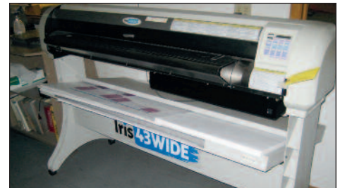
Iris Large Format Proofer Model 43 Wide