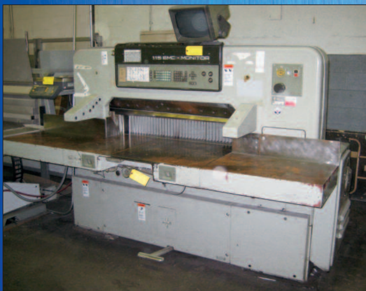
POLAR MOHR 115-EMC PAPER CUTTER