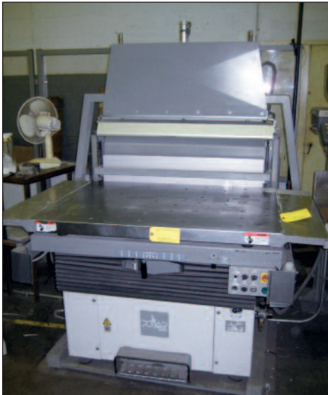
Polar Mohr RA-4 Paper Jogger