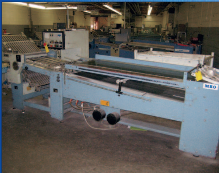
MBO CONTINUOUS FEED FOLDER MODEL B123-C