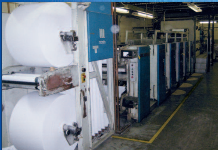
HARRIS M-110 HEATSET WEB PRESS, 5-UNIT