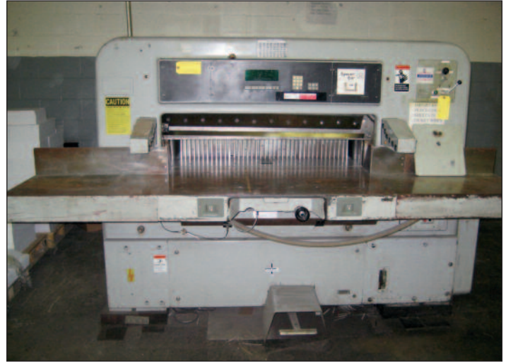
Polar Mohr 115-CE Paper Cutter