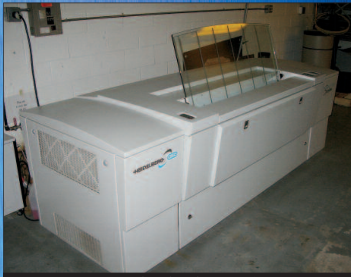
HEIDELBERG / CREO TRENDSETTER SPECTRUM TS8 CTP SYSTEM