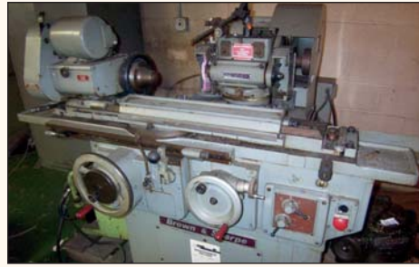
Brown & Sharpe 814U-Valumaster Cylindrical Grinder