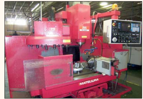
Matsuura MC-500V2 Vertical Machining Center