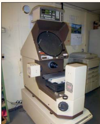
Mitutoyo 14" Optical Comparator #PH350