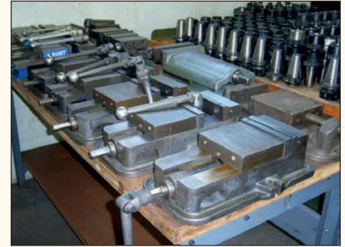
View of Kurt Vises