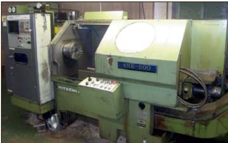
Hitachi Seiki 4NE-600 Turning Center