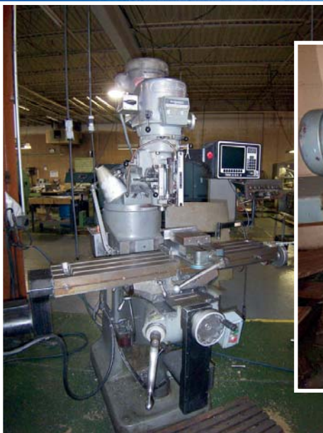
Bridgeport CNC Vertical Mill, TRAK AGE2 Control