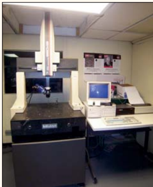
Mitutoyo B504B Coordinate Measuring Machine