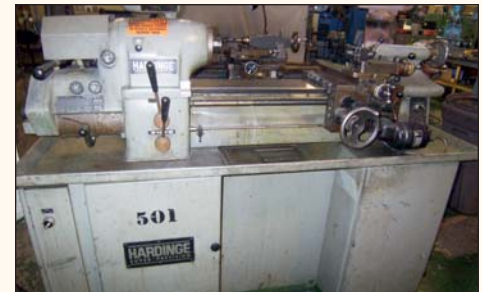
Hardinge HLV-H Lathe