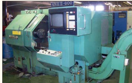
Kia "KiaMaster" 4NE II-600 Turning Center