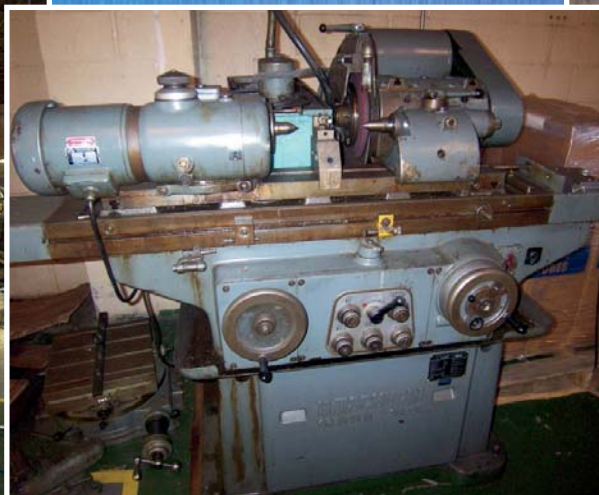
H.TSCHUDIN HTG 400 Cylindrical Grinder