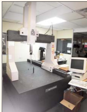
Mitutoyo B251 Coordinate Measuring Machine