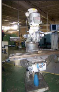
Bridgeport 2 HP Series I Vertical Mill