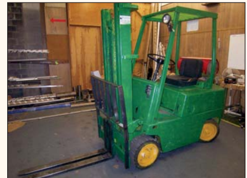
Clark 4,500 lb LPG Forklift #C500-45

Sunnen Precision Honing Maching Model MBB-1600 S/N 41986