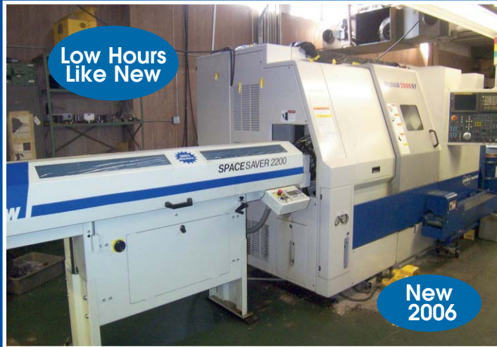
Doosan Daewoo Puma 2000SY Turning Center

FEATURING: (18) CNC MACHINING CENTERS & TURNING CENTERS BY DAEWOO, DECKEL, MAZAK, MATSUURA, HITACHI-SEIKI, MORI-SEIKI AND CINCINNATI MILACRON