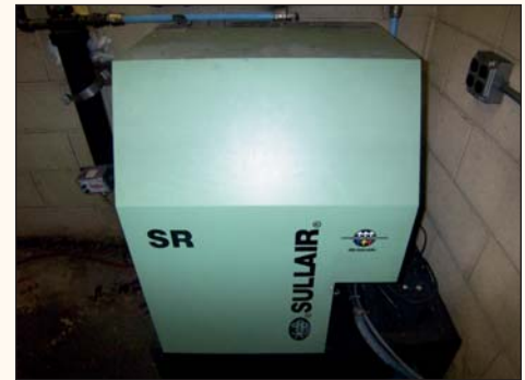
Sullair SR150 Compressed Air Dryer