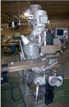
Bridgeport CNC Vertical Mill, TRAK AGE2 Control