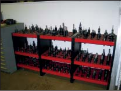
Large Assortment of CNC Tooling