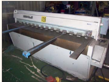
Edwards Power Squaring Shear #3.25mm Truecut