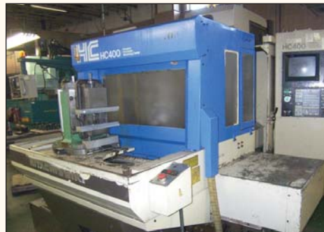
Hitachi Seiki HC400 Horizontal Machining Center

Hitachi Seiki Type CNC Turning Center (1994), Model High Tech-Turn 25S, S/N 25416-SC, 20" Diameter Swing, 23.6" Center Distance, 2.5" Bar Capacity, 20-3600 RPM, Kitagawa 10" 3-Jaw Chuck, Model Bravo-10, 10-Position Turret, Tailstock, Hitachi Seiki Model Seiki Multi CNC Control, Turbo Chip Conveyor