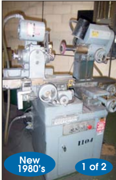
Cincinnati Milacron MT Monoset Tool & Cutter Grinder