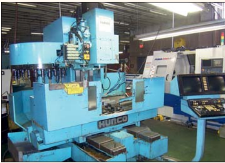
Hurco VMC40 Vertical Machining Center

SALE DATE: TUESDAY, MAY 19, 10:30 AM (EDT)