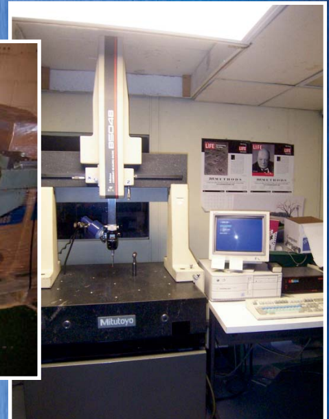
Mitutoyo B504B Coordinate Measuring Machine