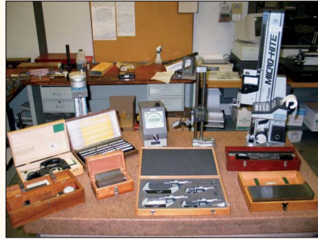
View of Inspection Tooling