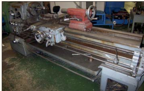
H.E.S. #500HN Lathe 22" x 68" CC