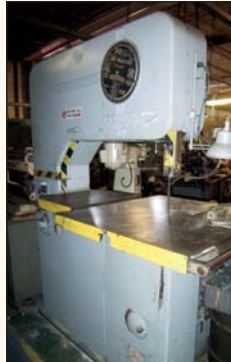
DoAll 36" Vertical Band Saw Model V-36