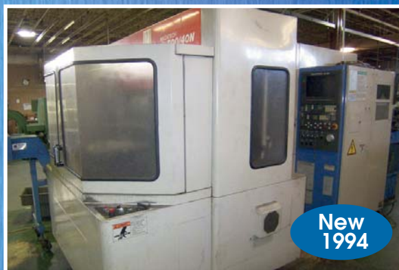
Mazak H-500/40N Horizontal Machining Center