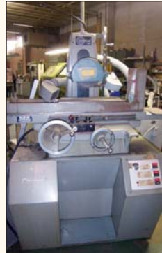
Harig 618W Hydraulic Surface Grinder