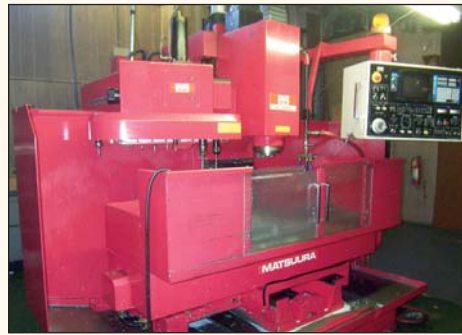
Matsuura MC-500V2 Vertical Machining Center