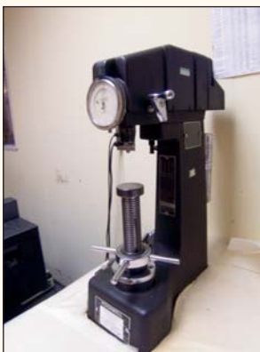
Wilson Rockwell 3R Hardness Tester