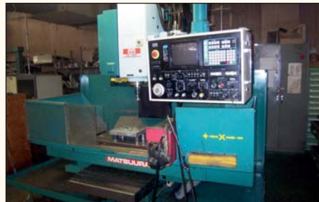
Matsuura MC-710V-2 Vertical Machining Center