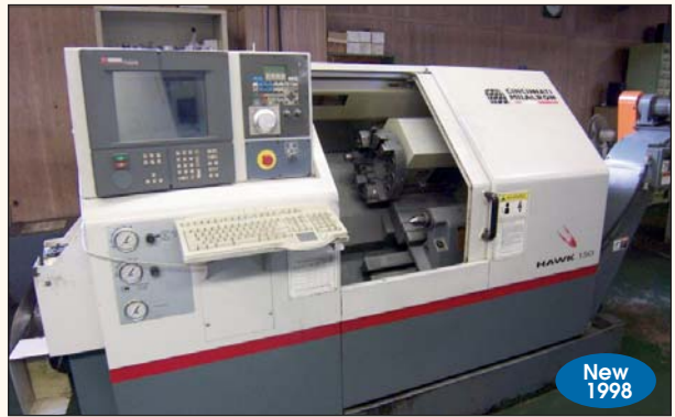
Cincinnati Milacron Hawk 150-A2100 Turning Center