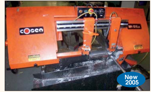
Cosen MH-1016JA Horizontal Band Saw