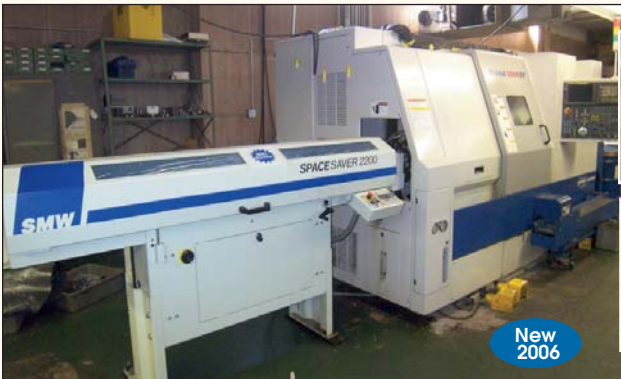
Doosan Daewoo Puma 2000SY Turning Center