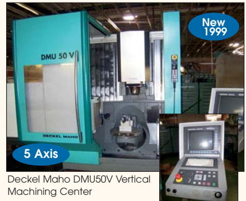
Deckel Maho DMU50V Vertical Machining Center

Hitachi Seiki CNC Turning Center Model 4NE-600, S/N NE41287, 22.8" Swing, 24.4" Turning Length, 2.75" Spindle Bore, 12-Position Turret, 8.875" X-Axis, 24.5" Z-Axis, New London Chip Conveyor, Fanuc System 6T CNC Controls 1986 Kia "KiaMaster" CNC Turning Center, Model 4NE II-600 S/N NE6492, 22.75" Swing, 24" Center Distance, 2.37" Bar Capacity, 12-Position Bi-Directional Turret, Tailstock, Kitagawa 10" 3-Jaw Chuck, Model B-10, Fanuc System 3T CNC Control, Turbo Chip Conveyor Mori Seiki CNC Turning Center Model TL-5 B-1000, S/N 964, Kitagawa 12" 3-Jaw Chuck, 8-Position Turret, Tailstock, 24.4" Swing Over Bed, 14.9" Swing Over Cross Slide, 42" Center Distance, Fanuc System 6T CNC Control, Chip Conveyor