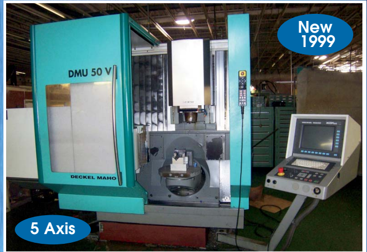
Deckel Maho DMU50V Vertical Machining Center