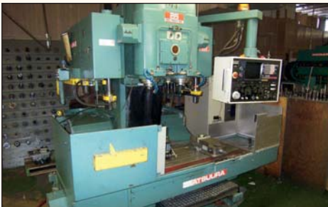
Matsuura MC-760V-DC Twin Spindle Vertical Machining Center