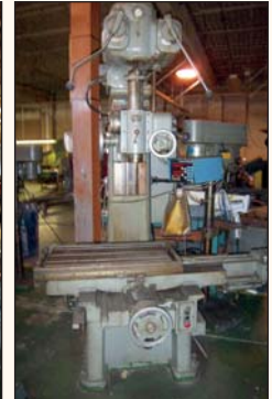
Cleerman Layout Sliding Head Drill Model LD