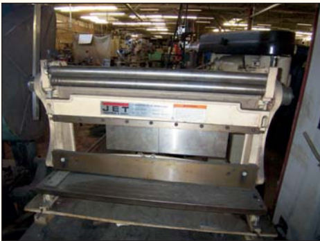
Jet # SBR-30N Shear, Brake and Roll Unit