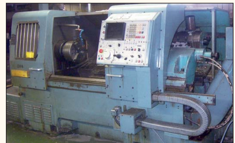
Mori Seiki TL-5 B-1000 Turning Center