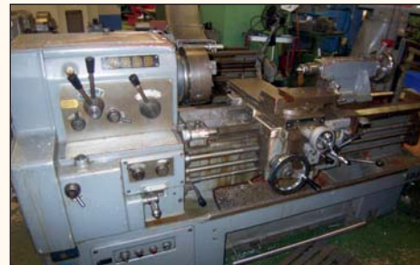
Webb Gap Bed Lathe 17"/29" Swing x 40" CC

Deckel Maho CNC Vertical Machining Center Model DMU 50 V, S/N 550 107, 19.68" x 14.96" Table, 19.68" X-Travel, 14.96" Y-Travel, 14.96" Z-Travel, Dual 30 Position ATC, Deckel Maho Model Millplus CNC Control 1994 Mazak Vertical Machining Center Model MTV-655/60, S/N 112677, 68.5" x 25.6" Table, 59.05" X-Axis, 25.6" Y-Axis, 25.6" Z-Axis, 30 Position ATC Mazak Mazatrol M-32 CNC Control, Dual Auger Type Chip Conveyor Hurco CNC Vertical Machining Center Model VMC40, S/N BA8002125A, 39 1/4" x 17" Table Size, 25 Position ATC, Hurco Model Ultramax BMC-40 CNC Dual Display Monitor System 1985 Matsuura CNC Vertical Machining Center Model MC-500V2, S/N 85044818, 15" x 34" Table, 20" X-Axis, 14" Y-Axis, 17.7" Z-Axis, 20 Position ATC, Matsuura Yasnac CNC Control, Matsuura Model EN4-00443A