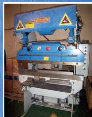
Di-Acro #14-48-2 Hydra Power Press Brake

SALE SITE: 191 COOLIDGE AVE. ENGLEWOOD, NJ - USA SALE DATE: TUESDAY, MAY 19, 10:30 AM (EDT)