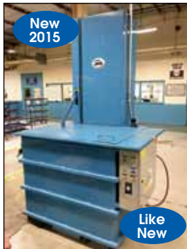
JRI IMMERSION TYPE PARTS WASHING MACHINE