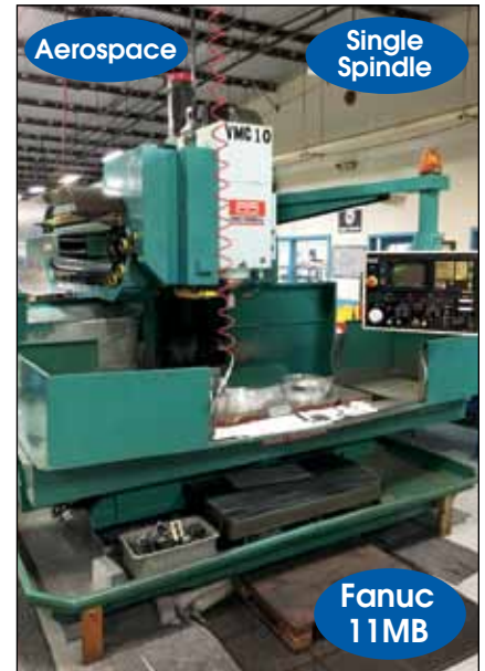
MATSUURA # MC-1000V CNC VMC