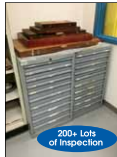
VIEW OF INSPECTION ITEMS