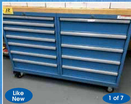
LISTA TOOL CABINET