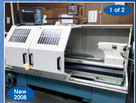
SWI-TRAK # TRL-2460-SX CNC LATHE