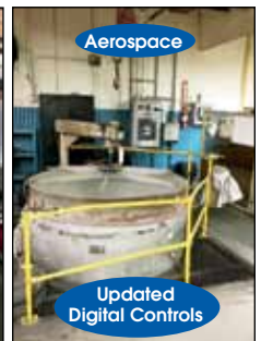
GENERAL ELECTRIC FLOOR TYPE FURNACE