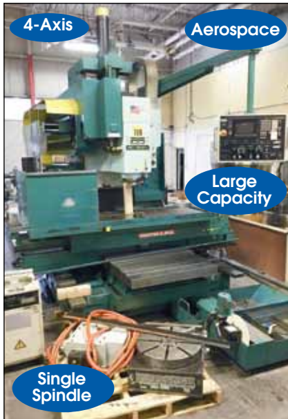
MATSUURA # MC-1500V "4-AXIS" VMC