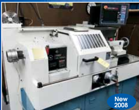
SWI-TRAK # TRL-1630-SX CNC LATHE

Inspection: Tuesday, November 15 th , 9:00 - 3:00