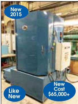
JRI "STAINLESS STEEL" 55" PARTS WASHING MACHINE