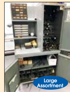
SUNNEN TOOLING CABINET W/ TOOLING