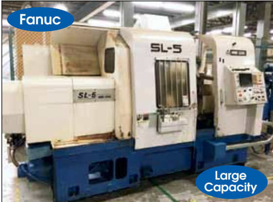
MORI-SEIKI # SL-5 CNC TURNING CENTER