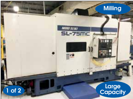
MORI-SEIKI # SL-75-MC CNC TURNING CENTER