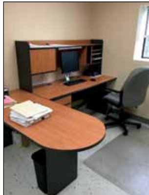
VIEW OF MODERN OFFICE SUITES