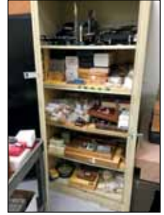
VIEW OF INSPECTION ITEMS

DISCLAIMER: Auctioneer is not responsible for descriptive errors covering specifications, Attachment options, models of assets offered at this auction, additions or deletions. Items offered may not necessarily be sold as described and/or photographed. Buyers should verify all aspects of their potential purchases during inspection as all items offered will be sold "as is, where is" with all faults. Please check with the auctioneer's office for additions or deletions.