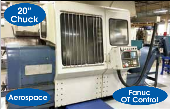
MORI-SEIKI # SL-7 CNC TURNING CENTER