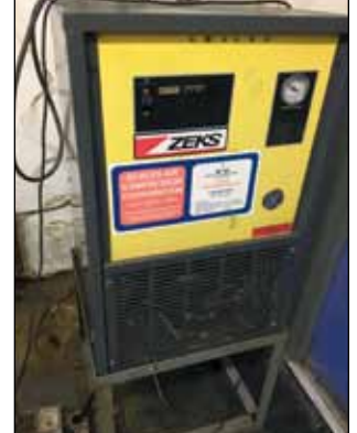
ZEKS AIR DRYER