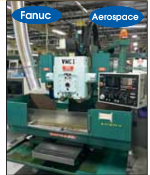
MATSUURA # MC-760V-DC "TWIN SPINDLE" VMC