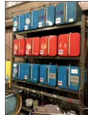
MOHAWK OIL DISTRIBUTION SYSTEM