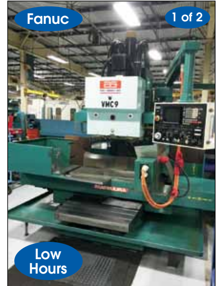
MATSUURA # MC-1000-VDC "TWIN SPINDLE" VMC