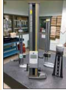
VIEW OF TESA-HITE 600 GAGE & INSPECTION ITEMS