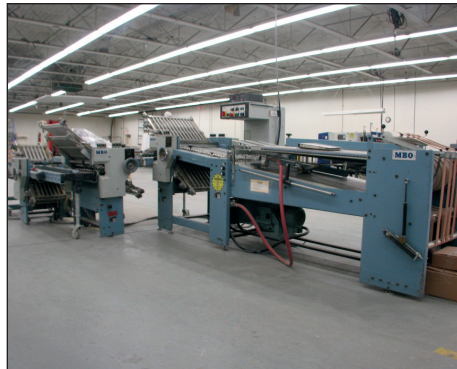
MBO FOLDER MODEL B23-C, 4/4/4