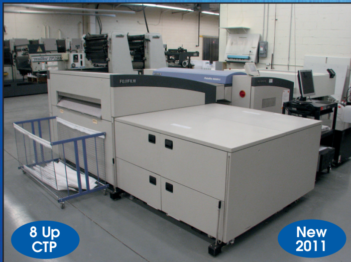
FujiFilm CTP System Model PlateRite 8600N-S