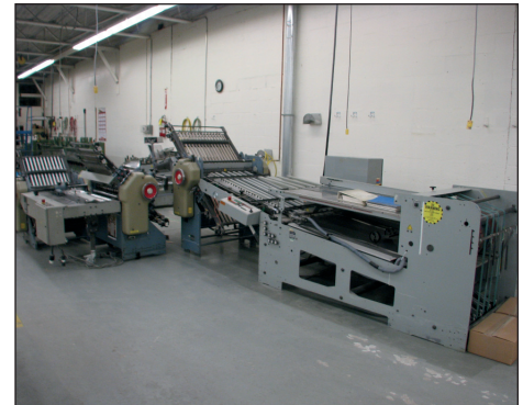
STAHL FOLDER MODEL RD-78, 4/4/4