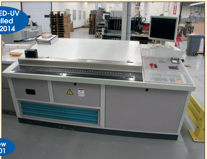
MAN ROLAND 8-COLOR PRINTING PRESS MODEL R708-P