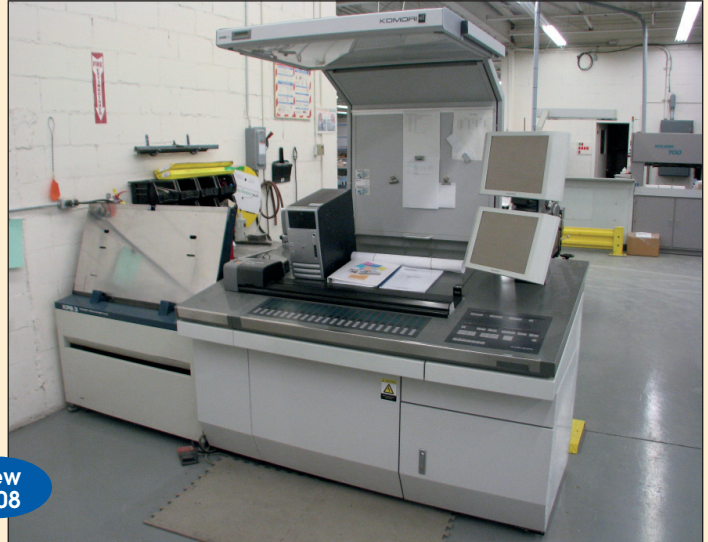
KOMORI 5-COLOR PRINTING PRESS MODEL LITHRONE SX29-5+L