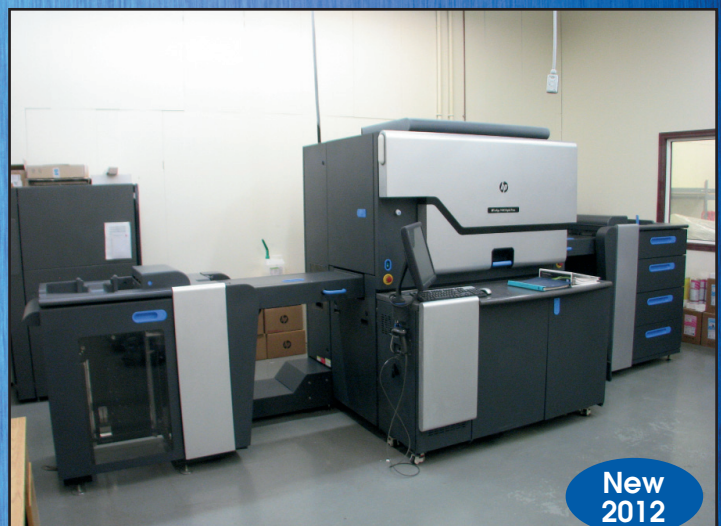
HP Indigo 7600/7800 Digital Printing Press