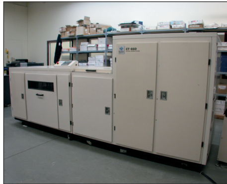
EPIC UV COATER MODEL CT-660