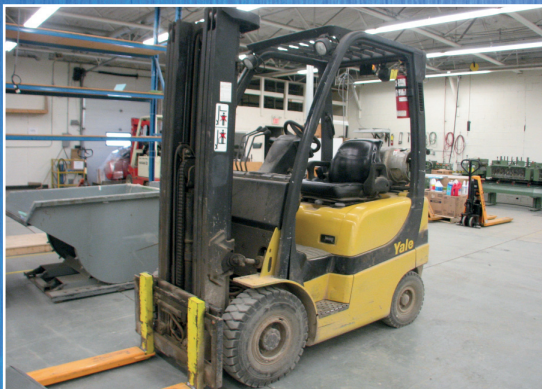
Yale 5000 lb. LPG Forklift

INSPECTION DATE: TUESDAY, JUNE 21, 9 AM TO 4 PM (LOCAL TIME)