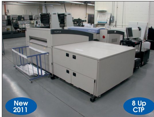
FUJIFILM CTP SYSTEM MODEL PLATERITE 8600N-S

PAPER JOGGERS Polar Mohr Paper Jogger Model RAB5 (New 1996)