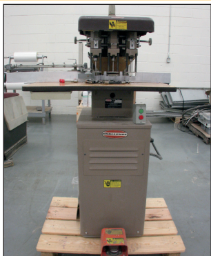
CHALLENGE 3-SPINDLE PAPER DRILL MODEL EH3A