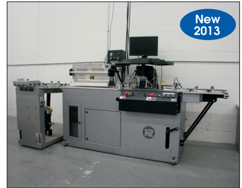
KIRK RUDY VARIABLE DATE PRINT SYSTEM