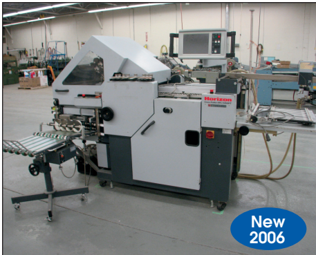
HORIZON AUTOMATED CROSS FEED FOLDER MODEL AFC 546AKT