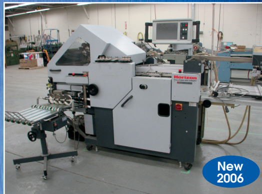
Horizon Automated Cross Feed Folder Model AFC 546AKT