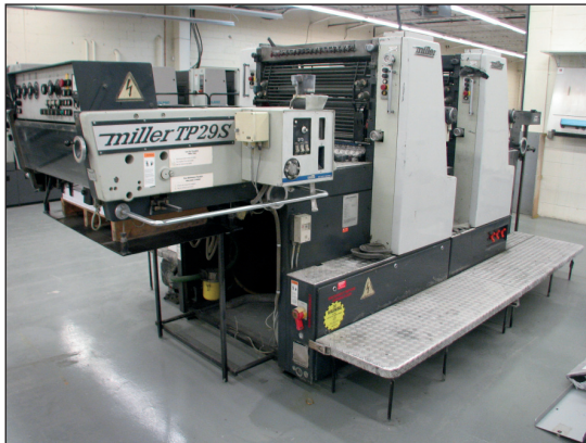
MILLER PRINTING PRESS MODEL TP29S, 2 COLOR