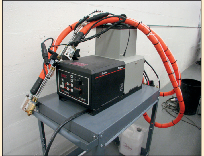
MOLL MARATHON FOLDER/GLUE, W/ITW DYNATECH GLUE SYSTEM