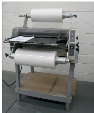
LEDco LAMINATOR MODEL HD-25, 2-SIDED