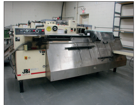
LHERMITE JBI WIRE-O-INSERTER MODEL BB38A