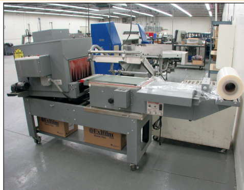
SEALTRON L-SEAL PACKAGING MACHINE MODEL OT-1608