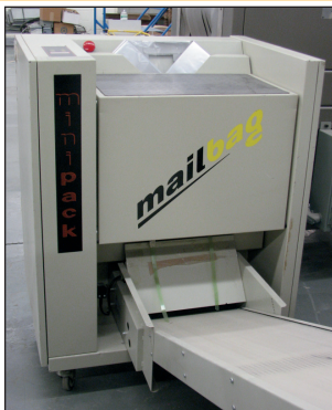
MINI PACK POLYBAG BAGGING MACHINE