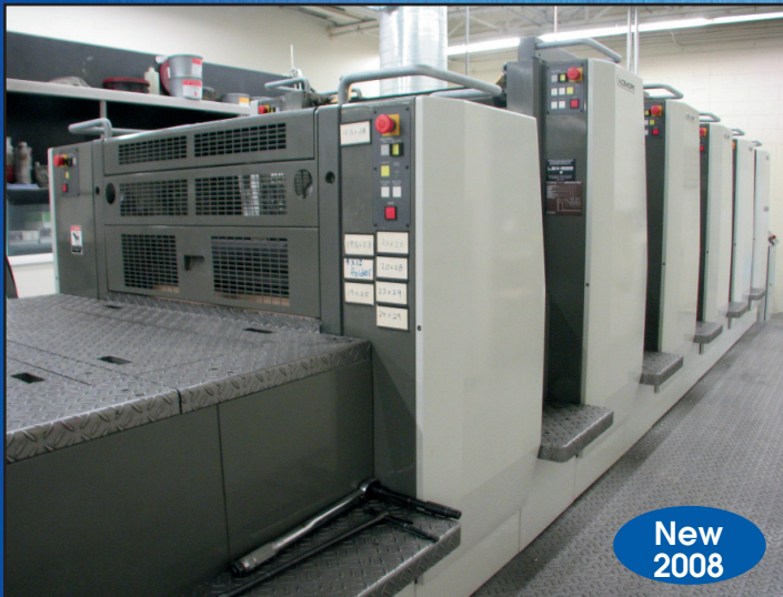
Komori 5-Color Printing Press Model Lithrone SX29-5+L

OPEN HOUSE INSPECTION: TUESDAY, JUNE 21, 9 AM TO 4 PM (LOCAL TIME)