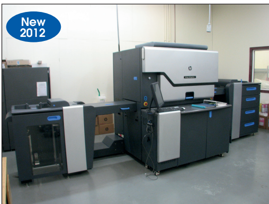
HP INDIGO 7600/7800 DIGITAL PRINTING PRESS

INSERTERS Mailstar 400 Mail Insertor, 6x9 Envelope Insertor, 6-Station, Open Feed Sta- tion, Conveyor