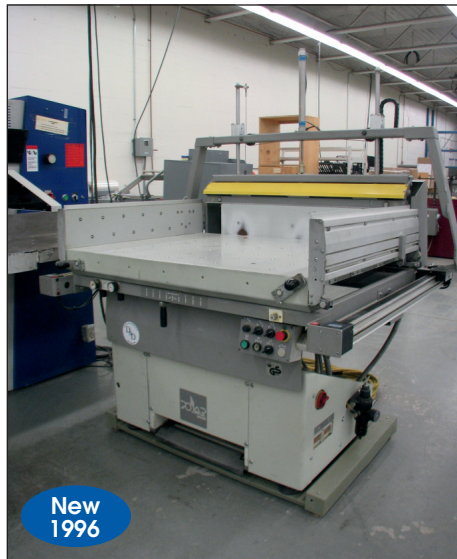
POLAR MOHR PAPER JOGGER MODEL RAB5