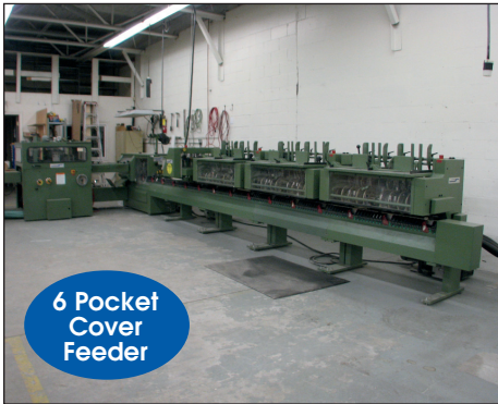
MULLER MARTINI SADDLE STITCHER LINE MODEL MINUTE MAN