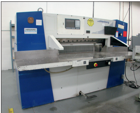
WOHLENBERG 45" PAPER CUTTER #CUT TEC 115