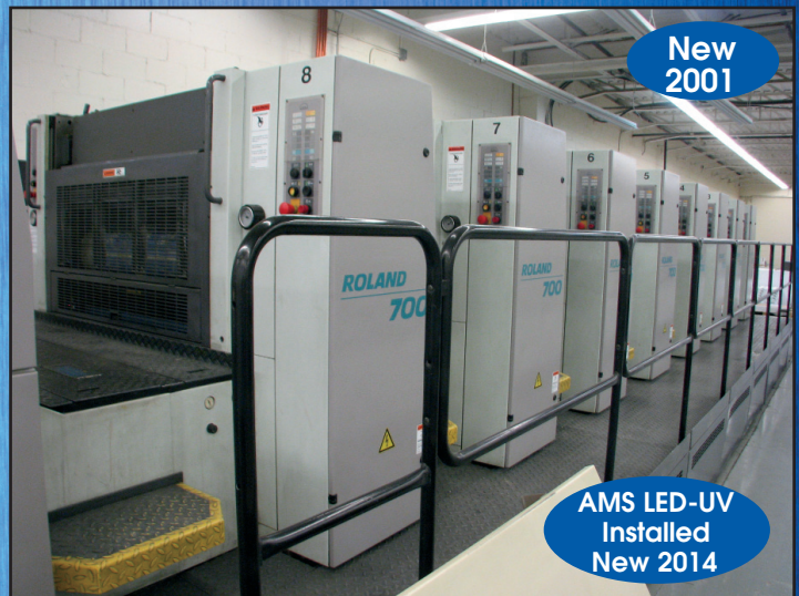
Man Roland 8-Color Printing Press Model R708-P