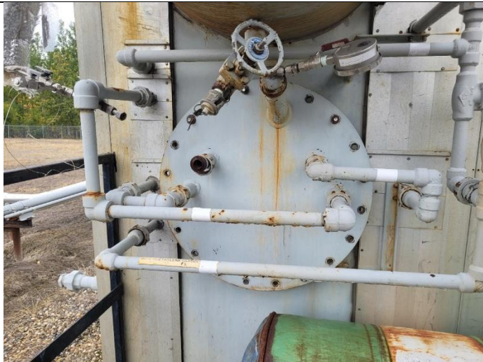
Accumulator has removable coil