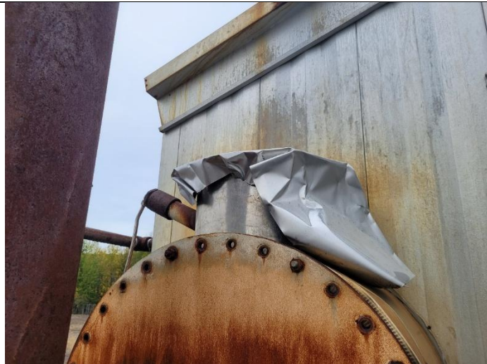
Still column removed at time of inspection