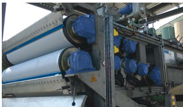
CPF Hippo 20 for dewatering sludge with a high fiber content ▼