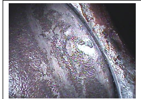
Idle end rotor taper clearance at the small diameter is good.