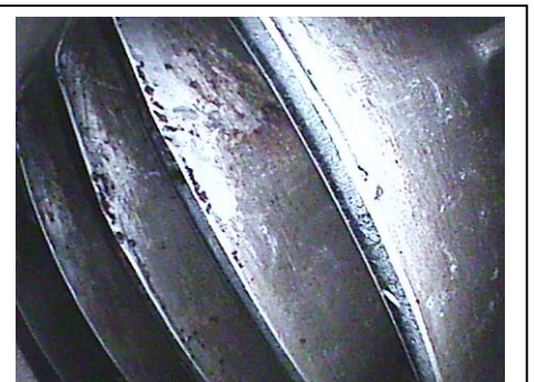
Idle end rotor taper is good.