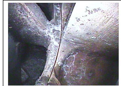
Idle end rotor taper clearance is good.