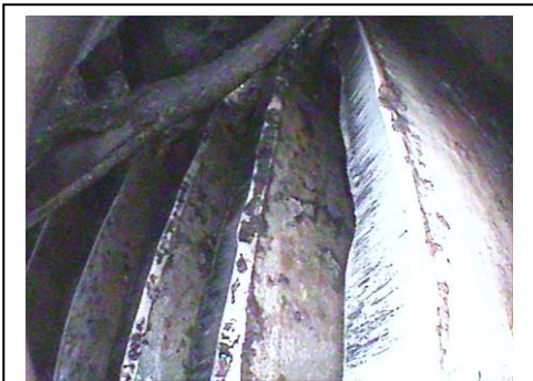
Drive end rotor taper is uneven.