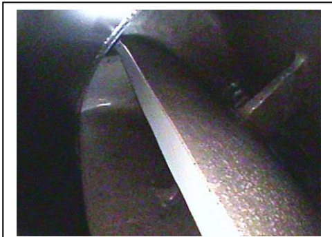
Outer Drive end Rotor Blades in good condition.