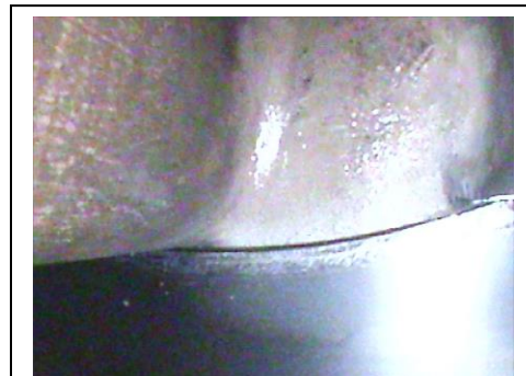
Idle end Rotor shroud clearance is good.