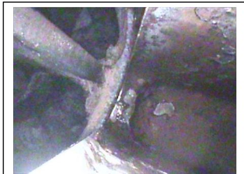
Drive end rotor taper clearance is good.