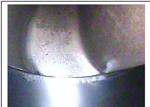
Drive end Rotor shroud clearance is good.

This pump is a Vooner and has an original test date August of 2015. The pump is stainless steel construction. The idle end clearances and the internals looks good. The drive end rotor taper is uneven and the taper clearance is slightly excessive at the tip.