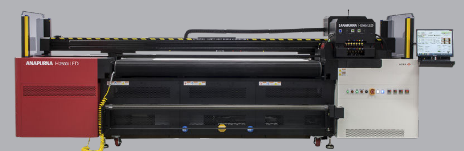
> Anapurna H2500i LED