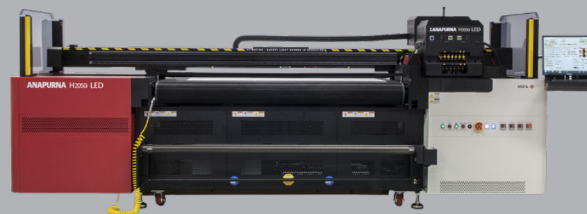
> Anapurna H2050i LED