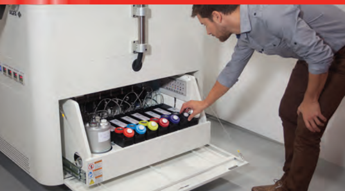
Conveniently located ink trolley

On top of that, thanks to their high-pigment load, the ink consumption per square meter is low. This so-called 'thin ink layer' technology saves costs and results in nicer looking prints.