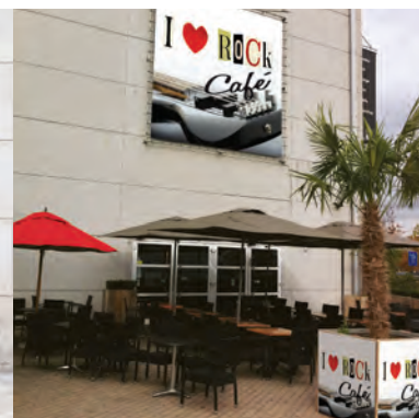
POP printing - wood & bache