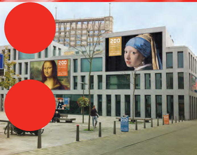
Outdoor communications - bache