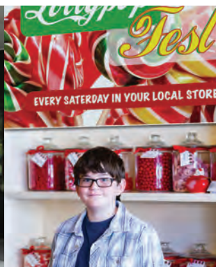
In-store communications - forex