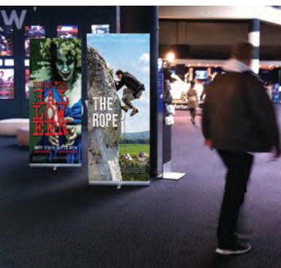
Indoor communications - polyester

Multiple board printing is possible to maximize your productivity even more. The borderless printing feature makes post-finishing superfluous.