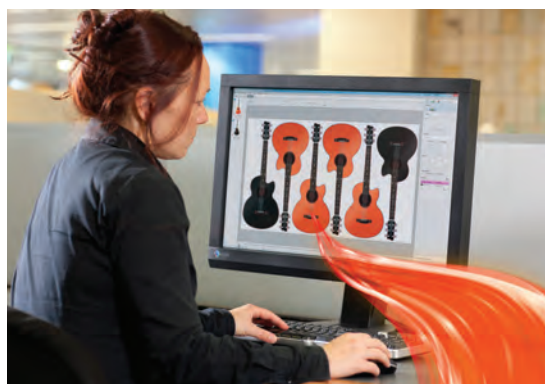
Asanti workflow software

Just like all wide-format printers from Agfa Graphics, the Anapurna M2500i is part of an integrated solution, including Agfa Graphics' Asanti wide-format workflow software, which streamlines production processes, increases productivity and maintains consistency across the board. Asanti removes the hit-and-miss elements of print production so that you can integrate all of your pre-press elements and the result is a fully accountable end-to-end quality management solution. Say goodbye to errors and costly remakes.