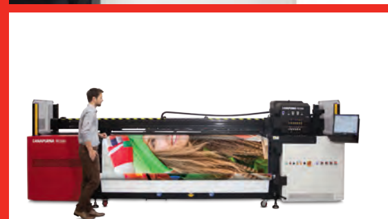
:Anapurna M2500i roll-to-roll