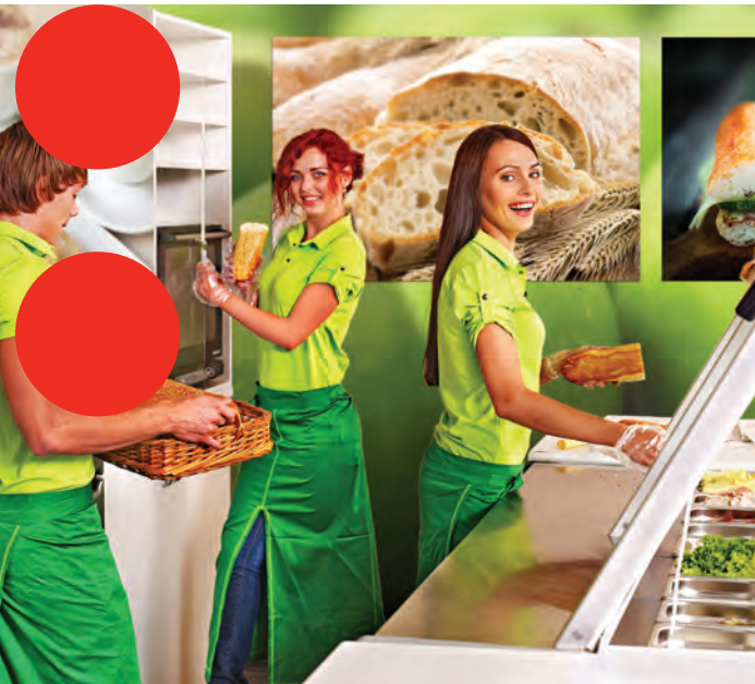
In-store communications - paper