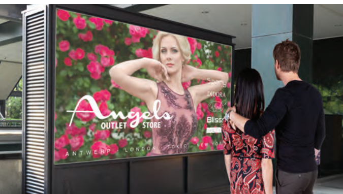
In-store communications - backlit

The 6-color Anapurna M2500i hybrid wide-format printer is a perfect fit for sign shops, digital printers, photo labs and mid-size graphic screen printers printing outdoor and indoor top quality wide-format jobs, on a wide range of rigid and roll-to-roll media. With the new design also come improved print quality and speed. A more accurate dot positioning, an enhanced curing system and higher performing print heads make the Anapurna M2500i into a heavy-duty, turnkey and complete UV inkjet system. The white ink function creates new possibilities for printing on transparent material for backlit applications or for printing white as a spot color. With the automatic board feeder, productivity is increased even more.