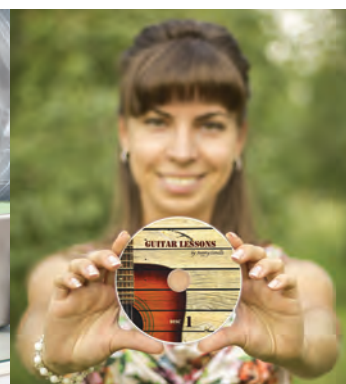
Gadget printing - dvd