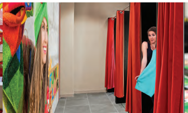
In-store communications - bache