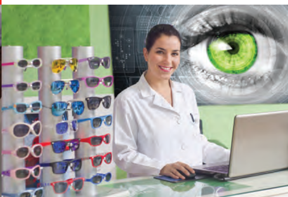
In-store communications - foamboard