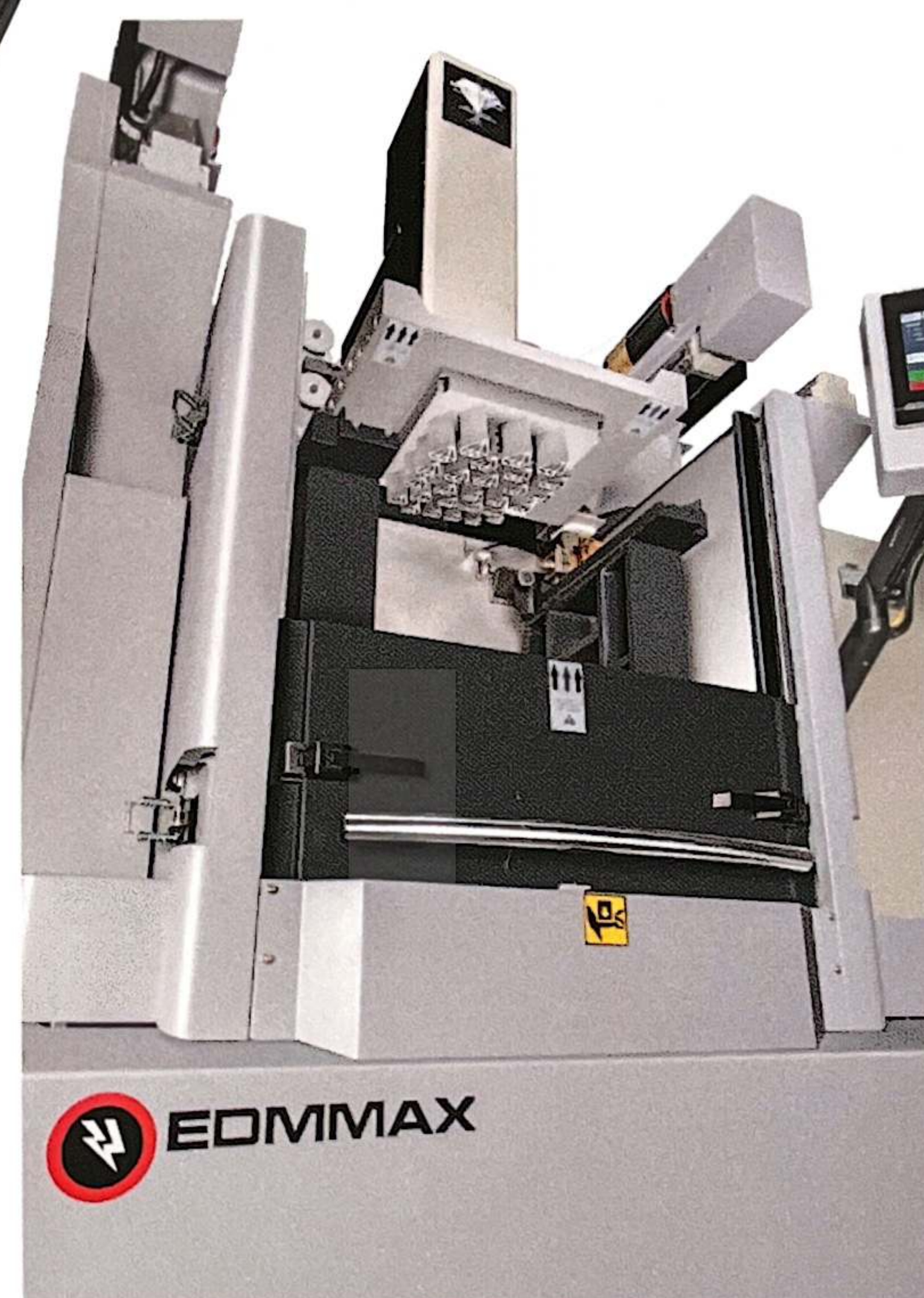
4 Inverted carrier and build plate now attached to Z-axis for wire alignment. Build plate ready to cut.