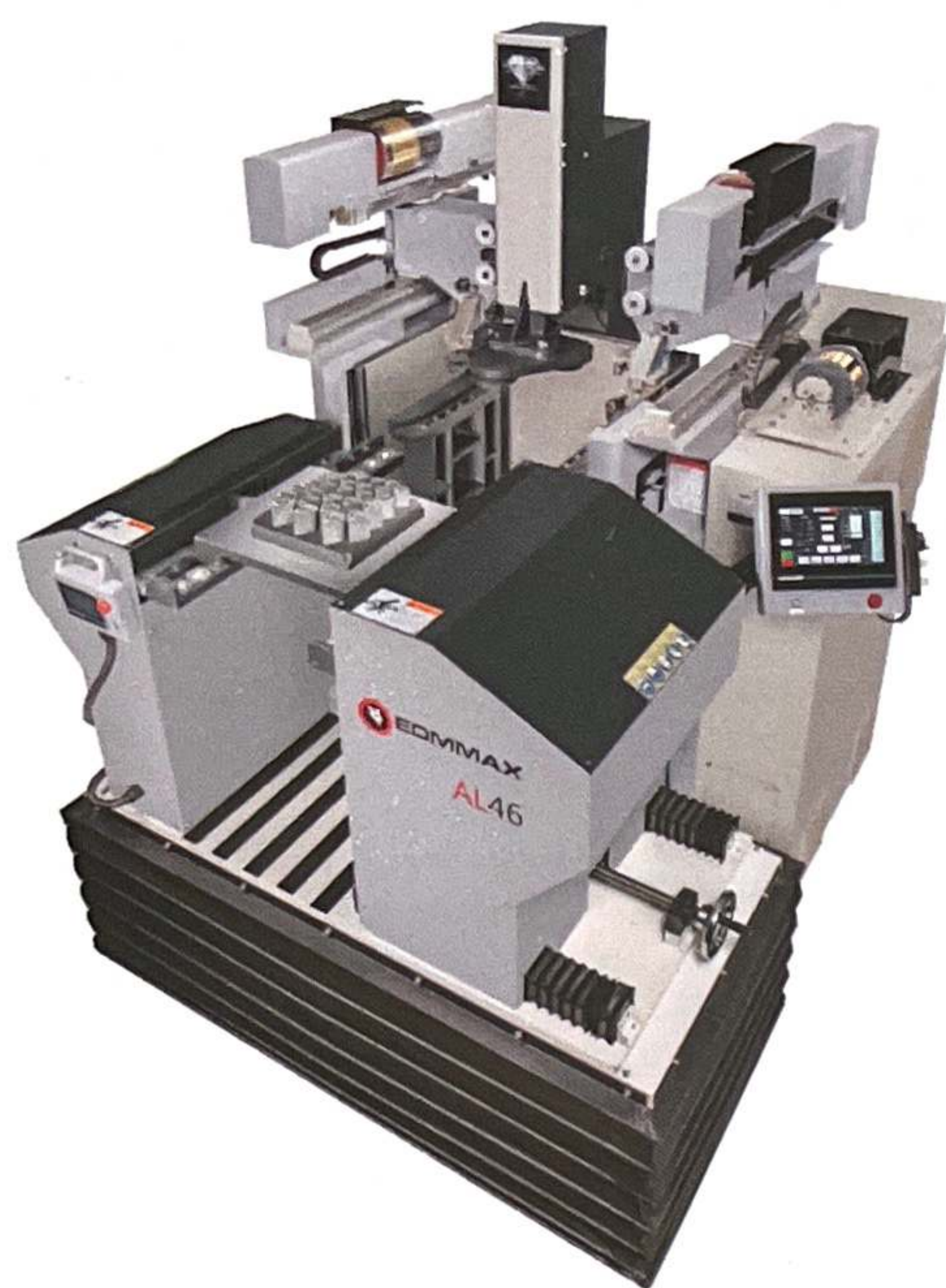
1 Load build plate to carrier plate - upright.