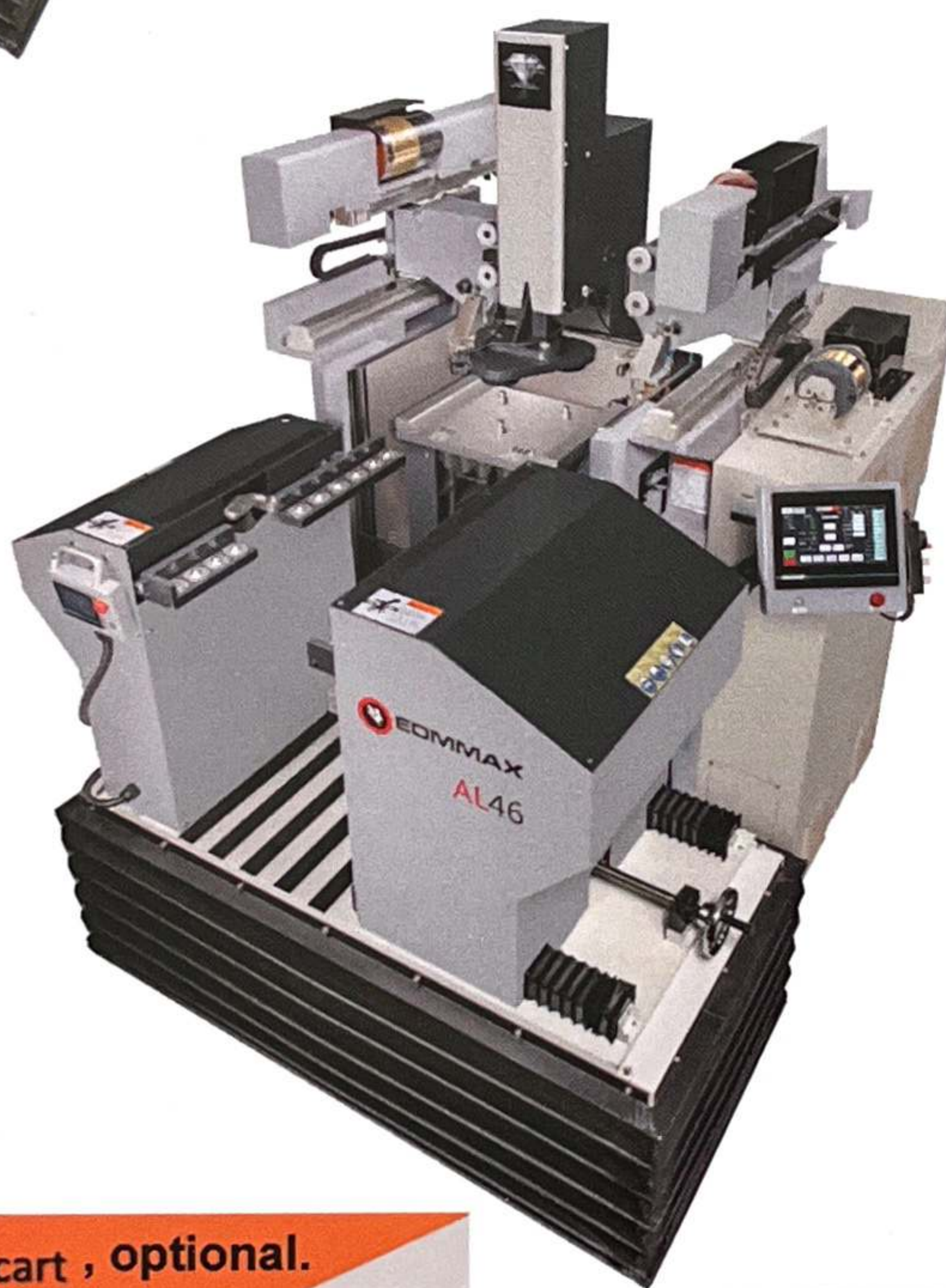
3 Carrier plate loaded into EDM on rollers. 3 draw bars allow for positive location.