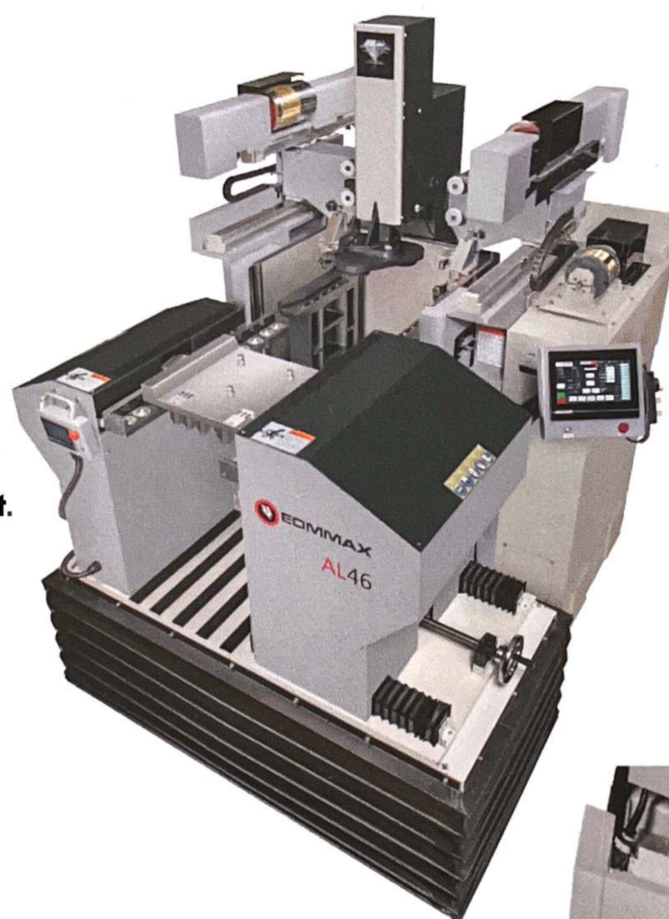
2 Load cart inverts assembly.