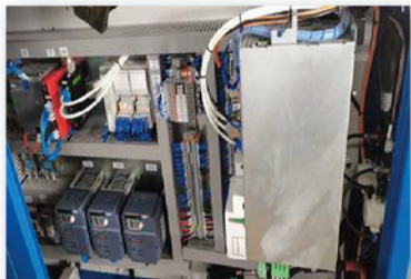
Compact Drive Technology