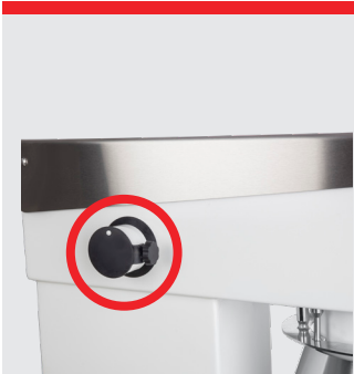
Attachment drive for meat mincer and vegetable cutter