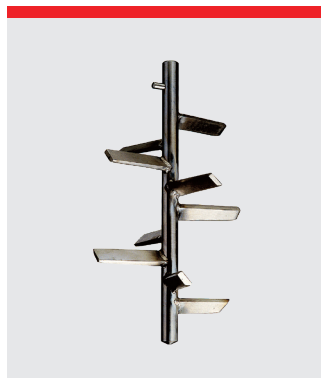
Powder mixer, stainless steel