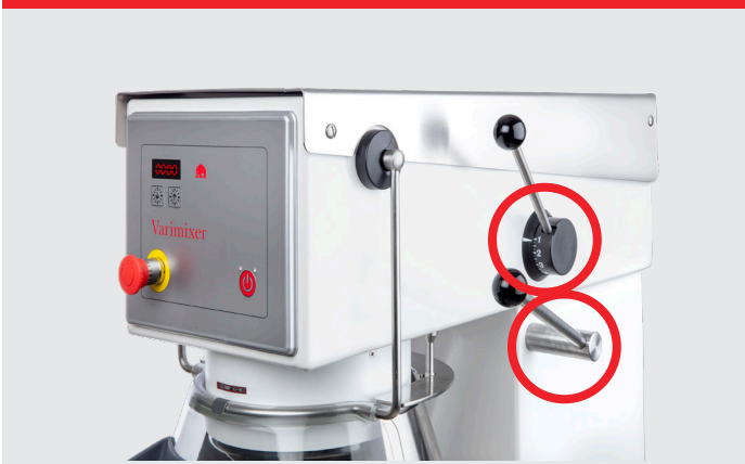
VL-1 – Manual speed regulation and manual bowl lowering