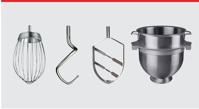
Whip, hook, beater and bowl 30 liter in stainless steel.