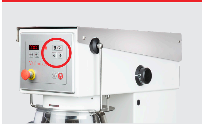
VL-1S – Automatic speed regulation and automatic bowl lowering