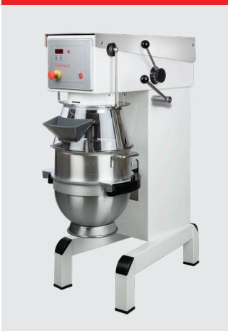
White, powder coated