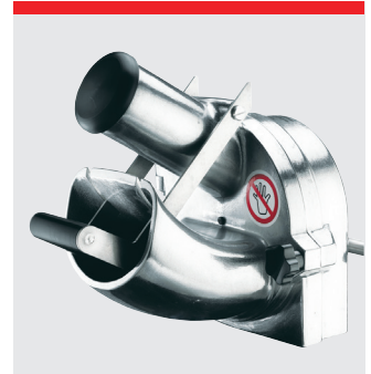
Vegetable cutter GR20