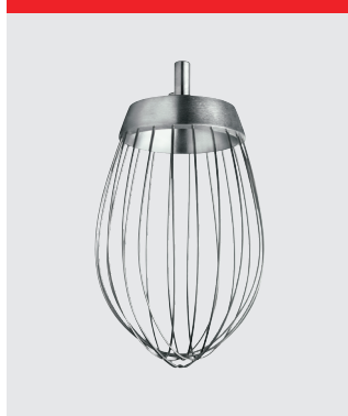
Whip with thinner wires, stainless steel