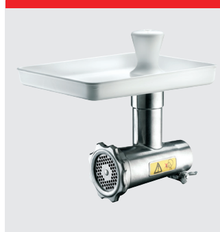
Meat mincer, 70 mm