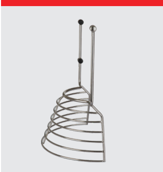
Stainless steel grid guard. Not CE-certified