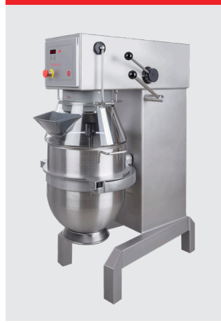
Marine version, stainless steel