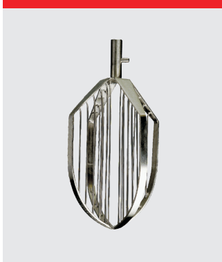
Wing whip, stainless steel