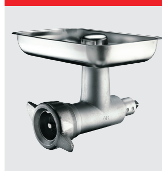
Meat mincer, 82 mm