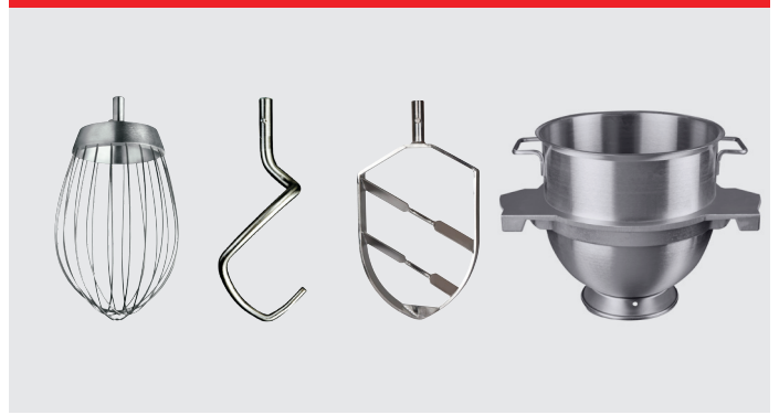
Whip, hook, beater and bowl 30/15 liter in stainless steel.