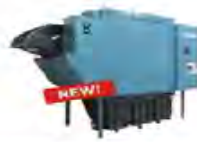
RG 2500-5000CFM 5-20HP Blower 136-544 sq. ft. 14" inlet