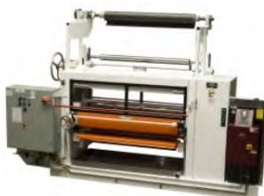
RHM-775 Hot Melt Adhesive Spreader

Roll and Rotary Laminating Presses - Your Top Choice for Industrial Gluing and Laminating Applications