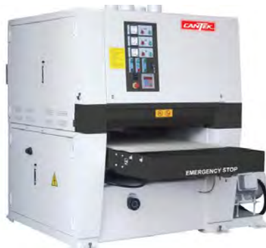
Cantek S251 24" Wide Belt Sander $13,100.00

30HP planing head 25HP sanding head 20HP sanding head 460/3/60