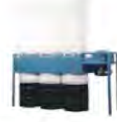
LW 2500-6000CFM 5-20HP Blower 35-210 sq. ft. 83-92 dB 9-16" inlet