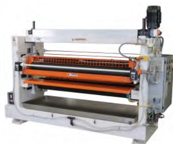
775 Adhesive Spreader