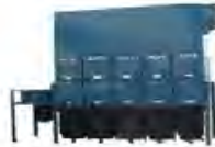
NBM 2500-9000CFM 5-30HP Blower 165-990 sq. ft. 83-92 dB 9-20" inlet