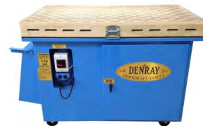
Model 2800 28" x 38" x 36" 1.5HP 2800 CFM