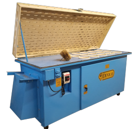
Denray 2872 $6,495 28" x 72"x36" 2HP 3400CFM

Many new and used dust collectors available