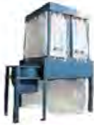
NBM-OP 2500-8000 CFM 5-20HP Blower 165-990 sq. ft. 83-92 dB 9-16" inlet