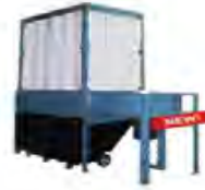
BEL 100 5000CFM 10HP Blower 227.96 sq. ftzz. 80dB 12" inlet