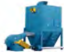
SBM 5000-18000CFM 15-30HP Blower 681-2724 sq.ft. 14-20" inlet