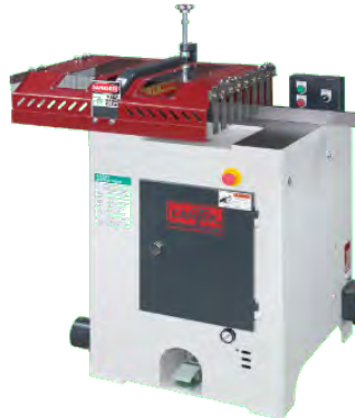
CANTEK PCS18 18" Pneumatic Cut-Off Saw Left or Right Handed $6,600.00

Add a TigerFence for Increased Production