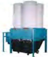
DW 2500-6000CFM 5-20HP Blower 70-240 sq. ft. 84 dB 10-14" inlet