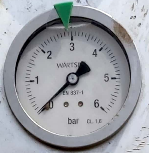
HT - WATER