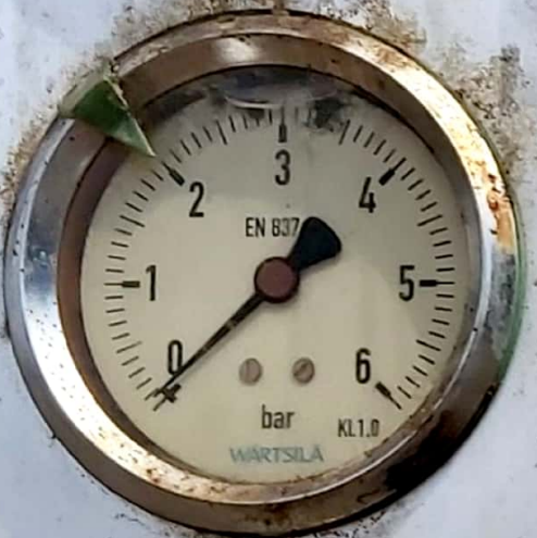
LT - WATER