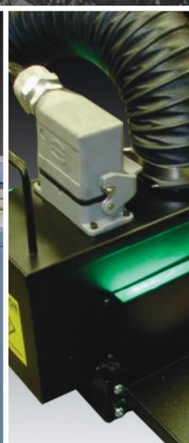
DESIGN & ENGINEERING

TEC Lighting is the world leader in the design, manufacture, and distribution of UV lamps, curing equipment, and special energy sources. We have over 100 years of combined experience in UV curing technology. Our flexible approach to engineering, problem solving and development of processes make us an ideal partner for your curing applications.