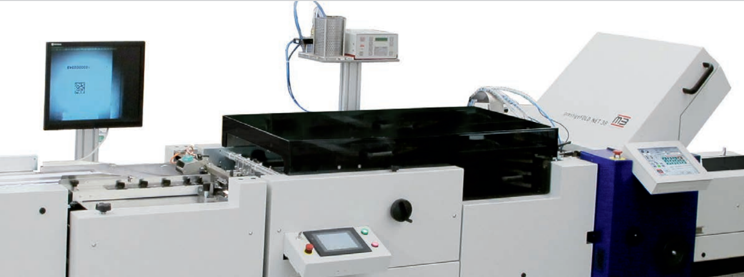
The innovation in the production of mailings.