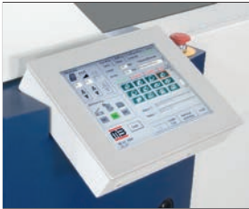
Simple operation via touchscreen

Together with the innovative possibilities of digital printing, the multipageMAILER opens up new approaches in the production of mailings. The individual design of the envelope adapted to its contents maximizes the advertising message and consequently leads to a significantly higher response rate.