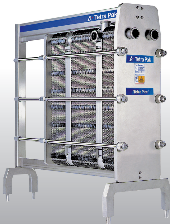
Plate heat exchangers