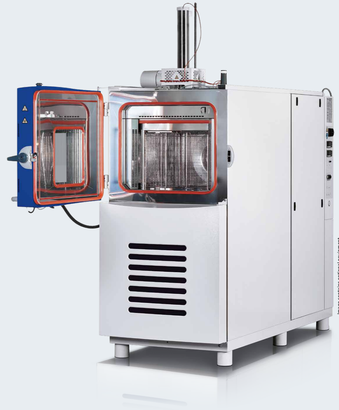
Image contains optional equipment

No need to worry about loss or excess of temperature: Test-chamber and test-object protection and test object shutdown are installed as standard. The test chamber itself is designed for operation at ambient temperatures of up to +35 °C, complying with the current VDE regulations and satisfying the EMV, low voltage and machine directives.