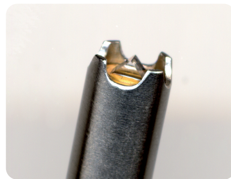
IN350-T Diamond ATR Probe head.