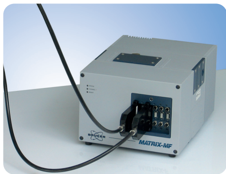
Automated 6-port multiplexer with Bruker's proprietary quick connector (BQC)