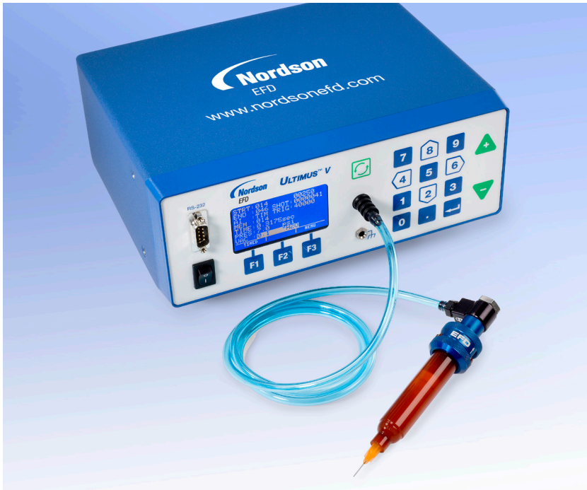
High-precision benchtop fluid dispensing control for advanced applications, two-part epoxies, and fluids that change viscosity.

High-precision benchtop fluid dispensing control for advanced applications