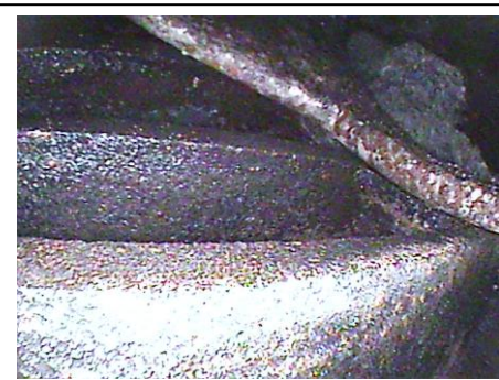
Drive end rotor taper slightly worn eroded.