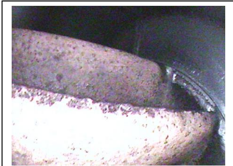
Outer Drive end Rotor Blades in good condition.