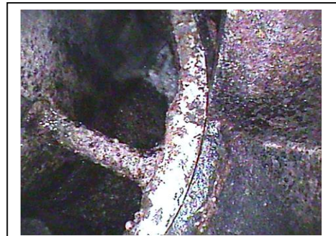
Drive end rotor taper clearance is good.