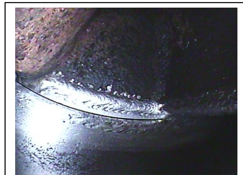
Idle end Rotor shroud clearance is good.