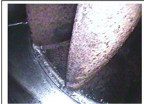
Outer Idle end Rotor Blades in good condition.