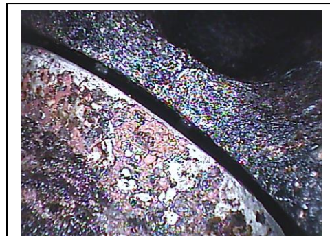
Idle end rotor taper clearance at the small diameter is very excessive.