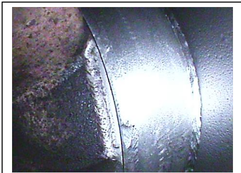
Drive end Rotor shroud clearance is good

This pump was repaired by ECM in October of 2013. The body and cones are stainless steel clad. The body is equipped with lobe purge tubing. The rotor shrouds have been stainless steel rung. The rotor taper clearances are excessive at the tip and the tapers are slightly worn and eroded. Monitor wear with future visits.