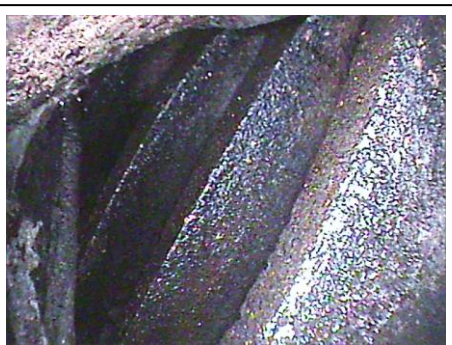
Idle end rotor taper slightly worn eroded.