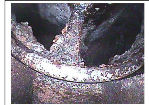
Idle end rotor taper clearance is good.