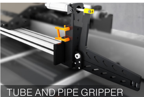
TUBE AND PIPE GRIPPER