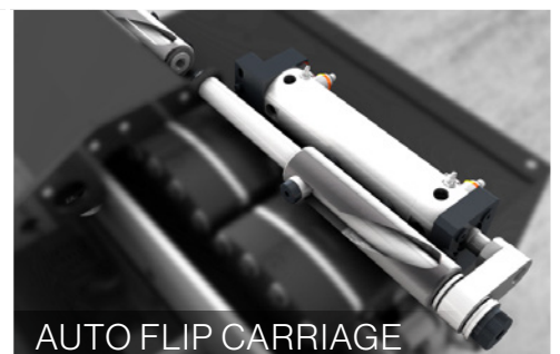
AUTO FLIP CARRIAGE