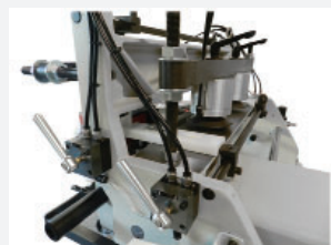
Pneumatic workpiece clamping

Add prestige to your cabinets with aesthetically pleasing dovetail drawer boxes with the Cantek JDT65 manual dovetailer. Dovetails display your quality and are built to last! Producing beautifully aesthetic dovetails for drawer box production from a wide range of wood types, including plywood and solid wood. The JDT65 machine produces both the pin and tail of the dovetail simultaneously. All four sides of the drawer can be loaded into the machine for optimum production capacity. The operator controls the dovetail unit by following a simple template allowing for ease of operation and quality joints. Equipped with a choice of four pitch templates for varying types of dovetail joints.