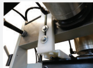
Anti-tear out blocks