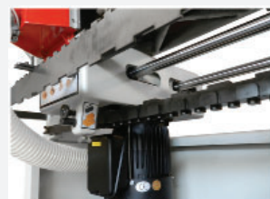
4-Sided template for various dovetail joints