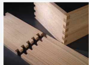
Sample of box dovetail joint (requires optional straight cutter)