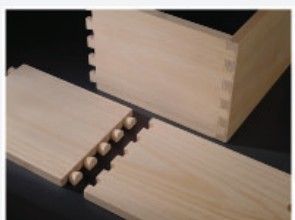
Sample of 1" wide dovetail joint