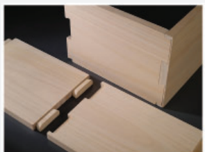
Sample of 2 1/2" wide dovetail joint