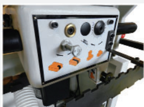
Simple machine adjustment