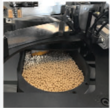
Teflon-coated glue pot