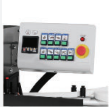
Operating panel with LED Keypad

The Cantek MX350M Automatic Edgebander is an entry level edgebander with pre-milling that is the perfect blend of quality and affordability. With fine attention to detail and quality componentry, the MX350M can output high quality edges on cabinet parts and more. The pre-milling diamond cutterheads machine the panel just prior to applying the glue to ensure optimum edge quality prior to applying the edge tape. Additionally, the machine is equipped with end trimming, flush trimming, PVC scraping, and buffing. User friendly controls and adjustments allow for efficient changeovers of edge tape thicknesses between 0.4mm & 3mm.