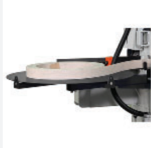
Edge feeding coil