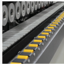
Heavy duty chain feeding