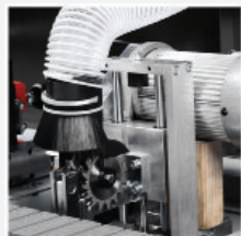
End trimming unit