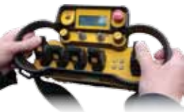
Starworker radio remote control