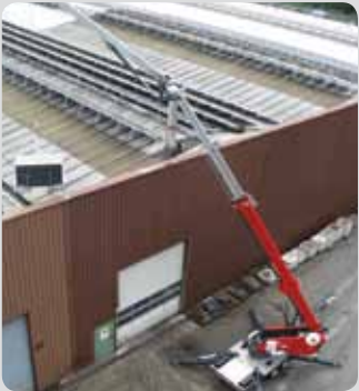
Optional working basket