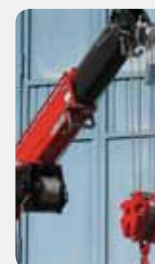
Full winch system (Capacity: 1650kg)