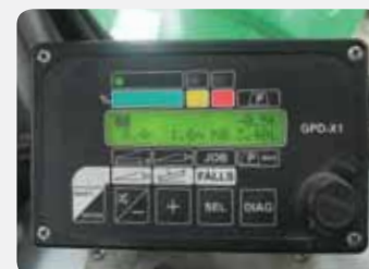
Digital Safe Load Indicator as standard