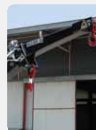
Optional rhino hook (Capacity: 800kg)