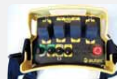
Radio remote control as standard