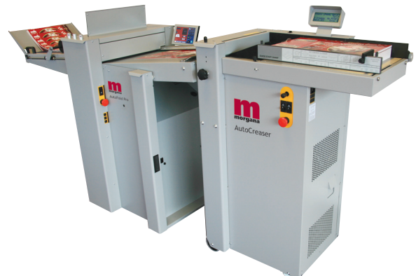
Picture shows AutoFold Pro with Morgana AutoCreaser

The beauty of the AutoFold Pro is its simplicity allowing the user of ANY manufacturer's creaser to invest in one and to improve their productivity and quality immediately.